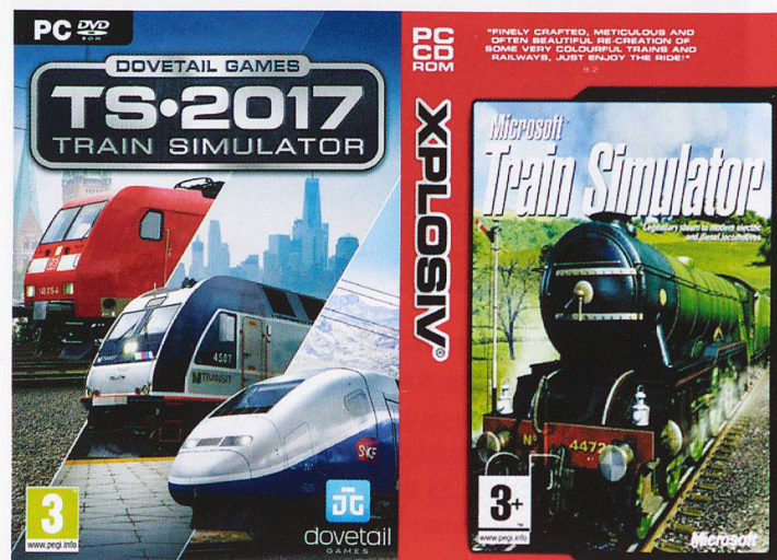
TS2017 and Microsoft Train Simulator.

problems trying to get complicated track work on a station approach to work. Giving-up I have gone back to MSTs.