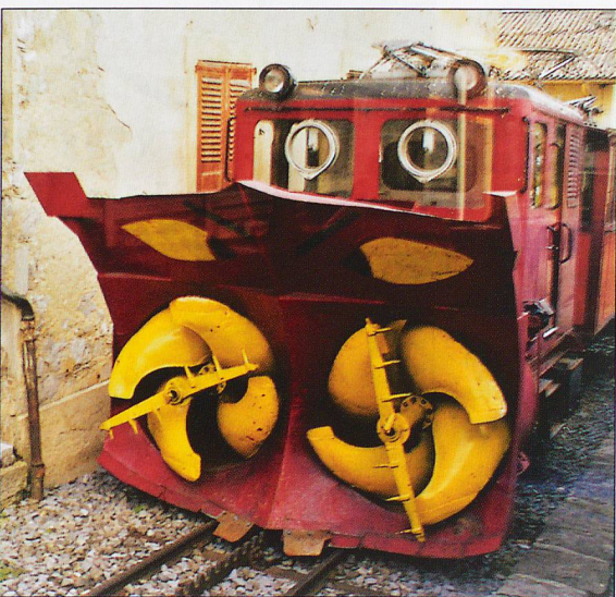
TOP & MIDDLE: Rochers-de-Naye trains in the snow. ABOVE: Rochers-de-Naye snow plough at Glion. BELOW: The Glion traversing system.