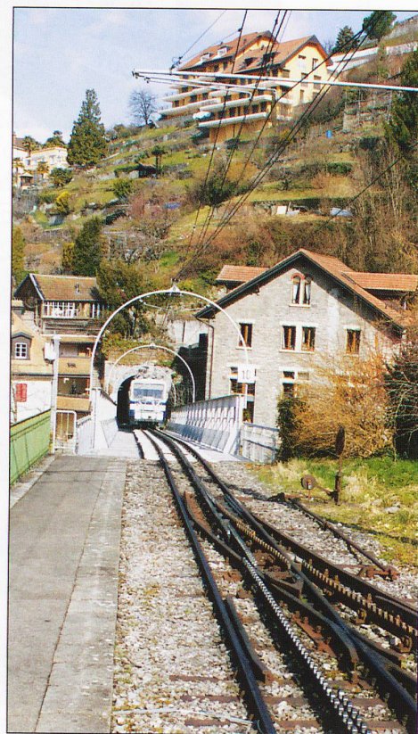
A train approaching Les Planches the disused loop in the foreground.

(1,970m) joining the train as it emerges from a steep tunnel at Les Planches, the first halt. A cheerful young driver shook hands as he welcomed us on-board to join the two other passengers – workers at the terminal building. "Did we really want to go to the very top?" To my response "Of course" he just grinned. After Caux there was much more snow and by Jaman (1,742m) we caught up with the snowplough! Unfortunately in the murk, plus the clouds of powdered snow it sent up, it was impossible to get a decent photo!