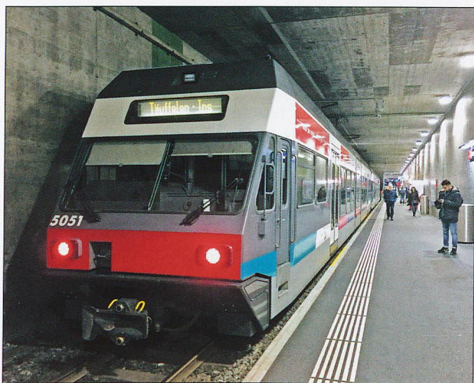
An Ins train arriving at Biel.

In pleasant sunshine we explored the walls and the old town before enjoying an excellent lunch. The weather then closed in so we returned to the comfort of the trains. Back to Ins and onto the Aare Seeland AG metre gauge to Biel. This passes the company's very modern and quite extensive depot at Tauffelen and ends in a dreadfully bleak concrete bunker beneath Biel station. We dashed through the busy main station onto a train towards Delle. Finding it did not stop at Tavannes (as planned) we rode to Glovelier. This rural junction may be charming on a warm summer's day but with a cold biting wind in March it has little to offer. There was an excellent tearoom, but with little time to enjoy the ambience we chose some portable patisserie for our onward journey.