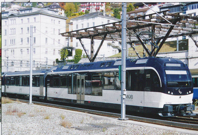
MOB Be4/4 9201 at Montreux.