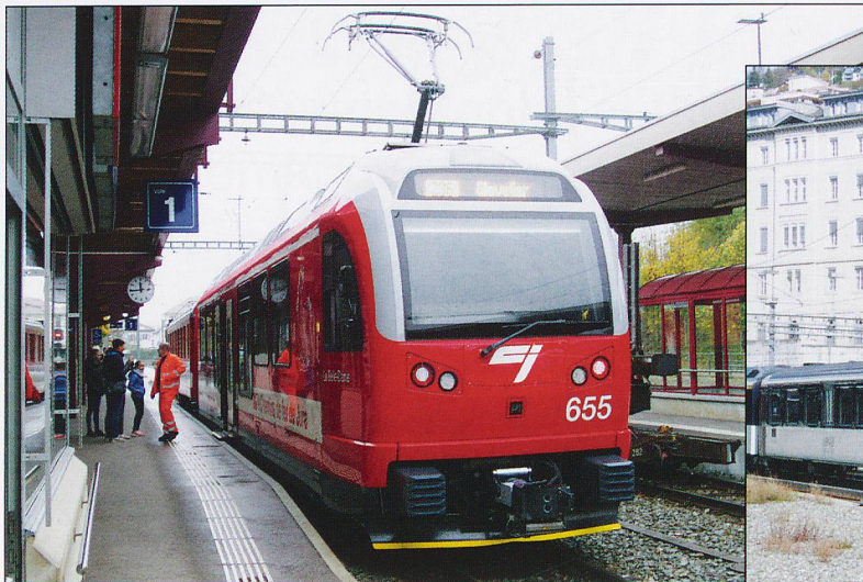
CJ Be4/4 655 at Saignelegier.