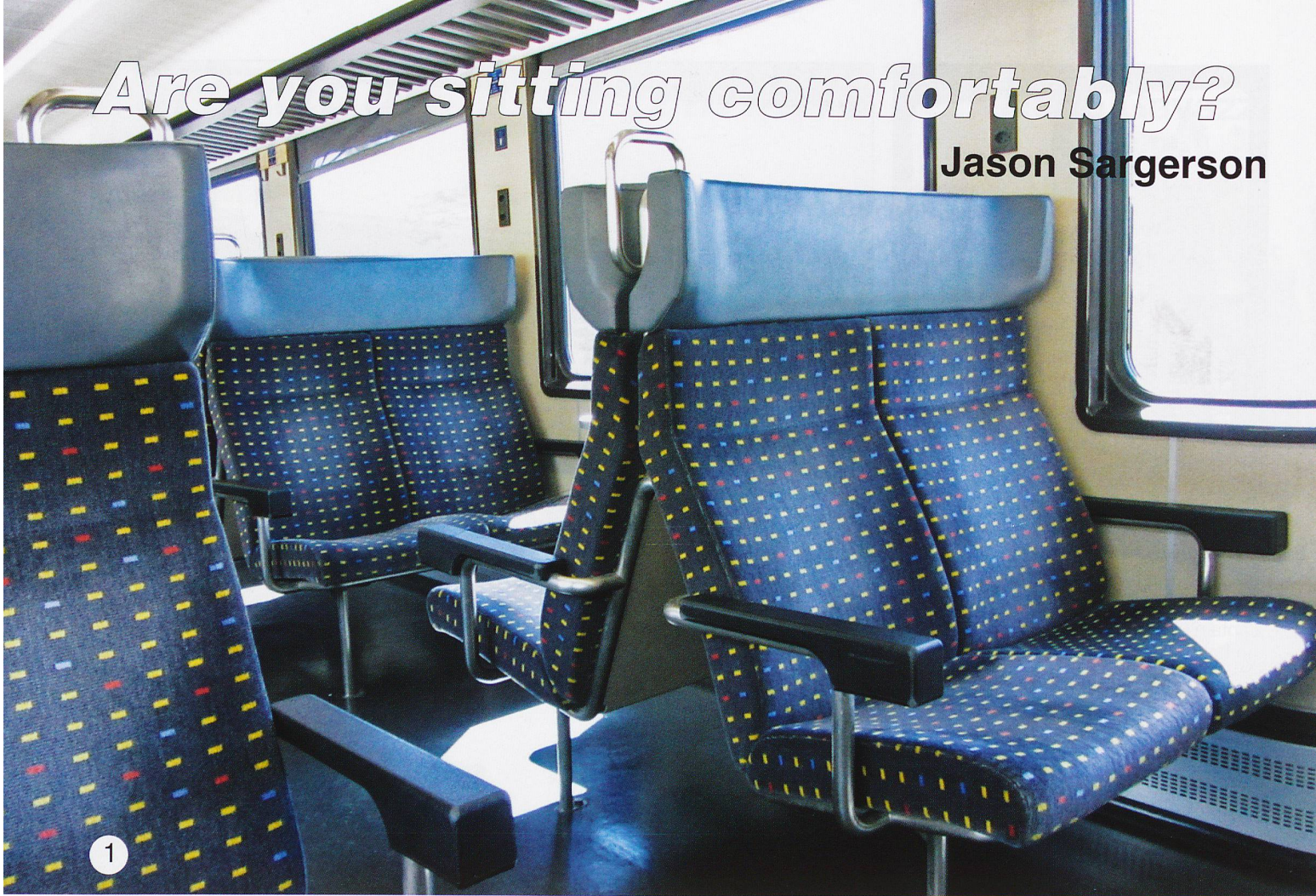
1. SBB, Mark IV Stock, 2nd Class.

taken in July and August 2017