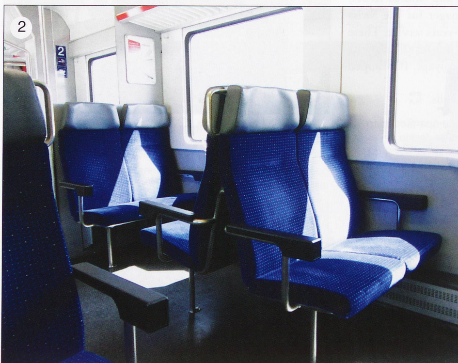
2. SBB, Class 560 Domino, 2nd Class.

The first seat, ① is in the SBB Mark IV 2nd Class coach. I am quite comfortable in this type of seat for a long journey such as from Genève to Brig (2.5 hours). It has good leg support; a reasonable angle for the back; headrests that you can actually use; a small table and a window matching the seat. I often have to clean the window of finger marks and smudges though. One disadvantage is that the armrests are fixed. There is also plenty of room for heavy luggage under or between the seats. Seat ② is the SBB Class 560 2nd Class coach. These trains run in the Rhône Valley from St Gingolph to Brig and are intended for shorter