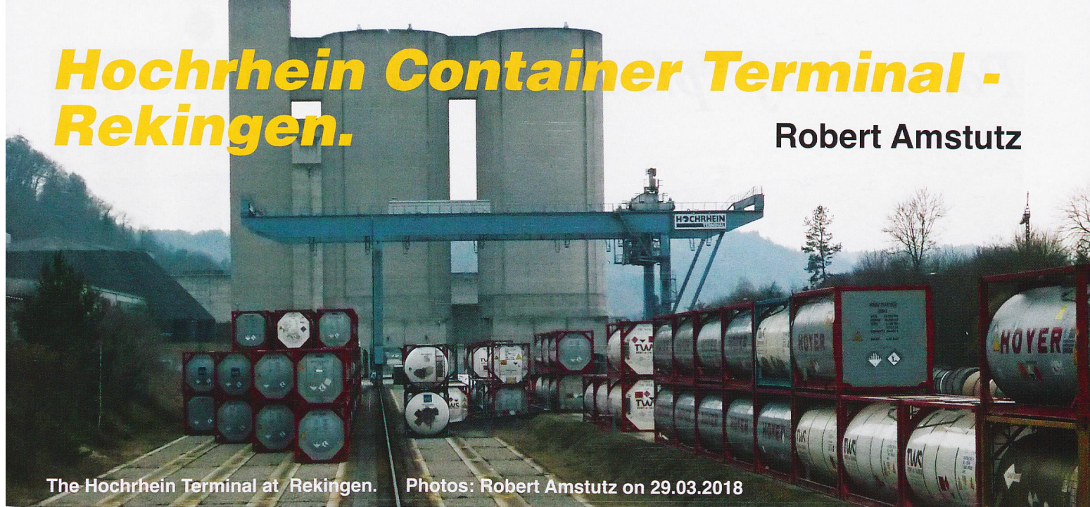
The Hochrhein Terminal at Rekingen.