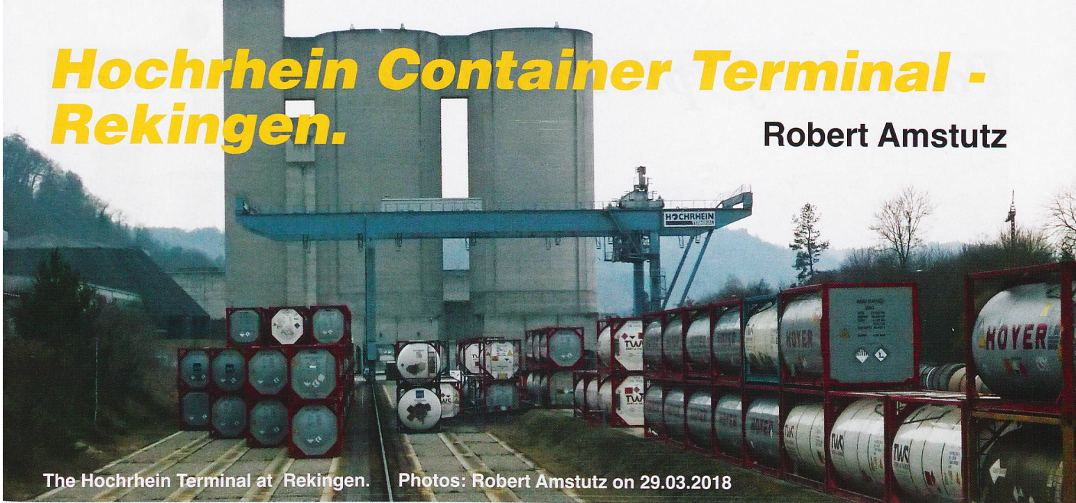
The Hochrhein Terminal at Rekingen.

In the heyday of the cement works and the Solvay Soda factory, Rekingen in Canton Aargau, on the line from Koblenz to Bülach, was the largest rail freight terminal in Canton Aargau, but two weeks before the December 2017 timetable change SBB Cargo announced that they would no longer serve the facility. This affected the Hochrhein Container Terminal located in the grounds of the former cement works, wagonload customers within the Solvay industrial park and also the transport of raw timber from Rekingen to destinations within Europe. At the same time, the previous operator of the container terminal terminated their lease. Faced with the above problems, the owners of the sites sought a solution and “Bahn-Support GmbH”, a subsidiary of Swiss Rail Traffic (SRT) has been contracted to handle traffic between Rekingen and the Limmattal (Zürich) marshalling yard, in addition to shunting the former Rekingen cement works and Solvay sites. SBB Cargo agreed to SRT continuing to use the SBB Cargo booking system so the freight movements are linked into the national network.