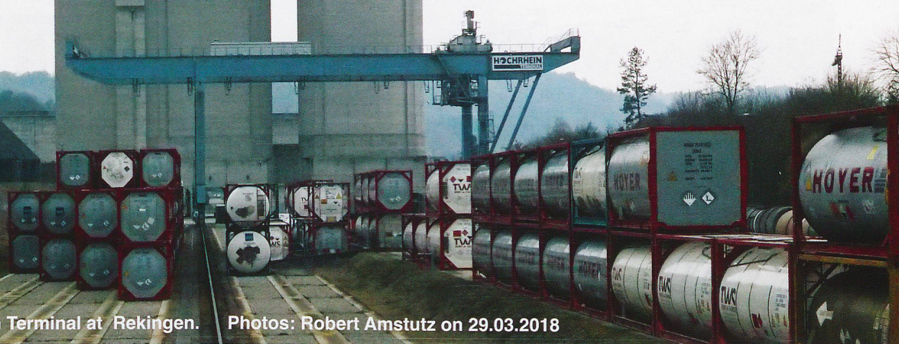
The Hochrhein Terminal at Rekingen.

In the heyday of the cement works and the Solvay Soda factory, Rekingen in Canton Aargau, on the line from Koblenz to Bülach, was the largest rail freight terminal in Canton Aargau, but two weeks before the December 2017 timetable change SBB Cargo announced that they would no longer serve the facility. This affected the Hochrhein Container Terminal located in the grounds of the former cement works, wagonload customers within the Solvay industrial park and also the transport of raw timber from Rekingen to destinations within Europe. At the same time, the previous operator of the container terminal terminated their lease. Faced with the above problems, the owners of the sites sought a solution and "Bahn-Support GmbH", a subsidiary of Swiss Rail Traffic (SRT) has been contracted to handle traffic between Rekingen and the Limmattal (Zürich) marshalling yard, in addition to shunting the former Rekingen cement works and Solvay sites. SBB Cargo agreed to SRT continuing to use the SBB Cargo booking system so the freight movements are linked into the national network.