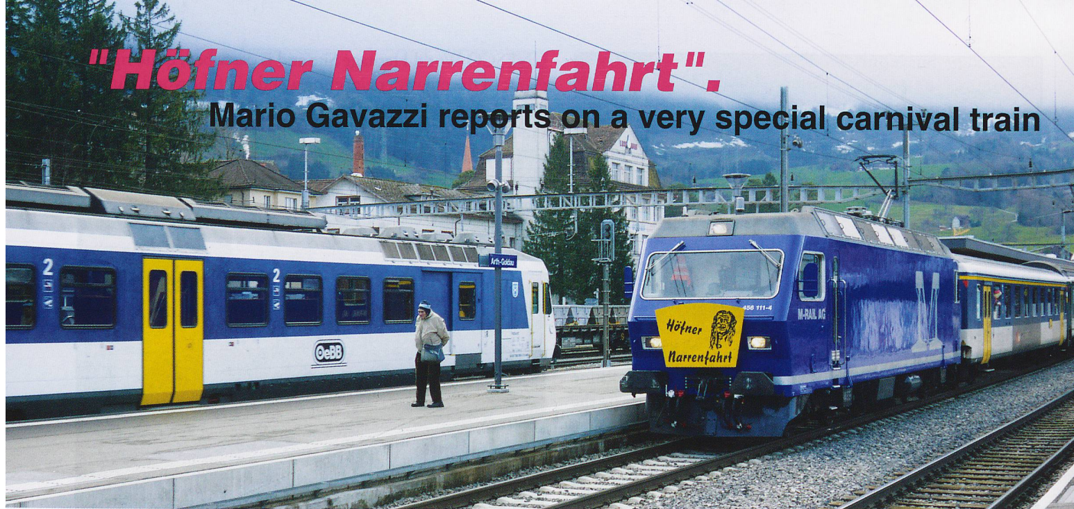
Meeting of the Narrenfahrt at Arth-Goldau with SOB-Voralpen-Express, operated by 'special guest' NPZ-RBDe 207 from Oensingen-Balsthal-Bahn.