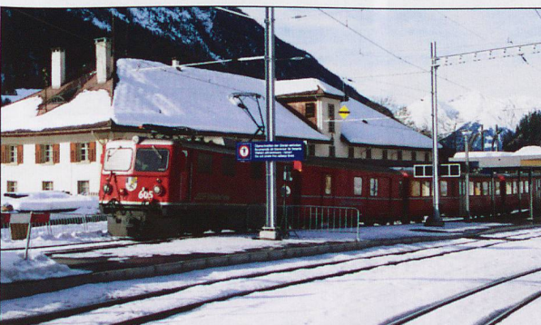
LEFT: 605 Bergün Schlittelzug. See ‘RhB Problems’, Page 29.