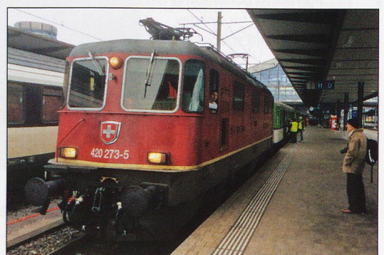
RIGHT: Re6/6 Gotthard Christmas Special. See ‘Re6/6 Hauled Rail Tours...’, Page 33.