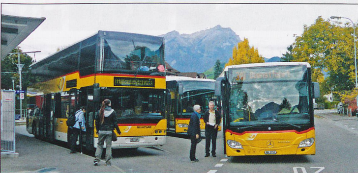
LEFT: Last of the double decker buses at Stans Bnf. See ‘Changes to ‘British’ Transport’, Page 32.