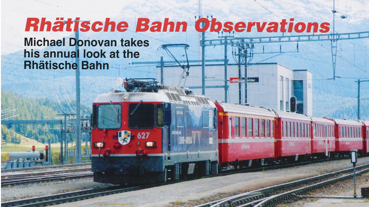
Ge4/4ii 627 works a Pontresina to Scuol-Tarasp service into Bever.