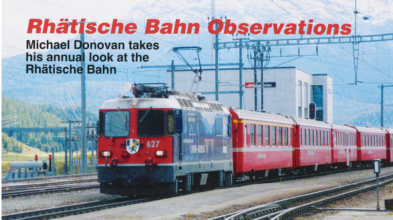
Ge4/4ii 627 works a Pontresina to Scuol-Tarasp service into Bever.