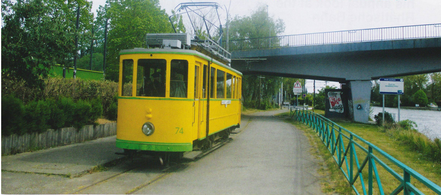
ABOVE: Neuchâtel No.74 waits at Wambrechies.