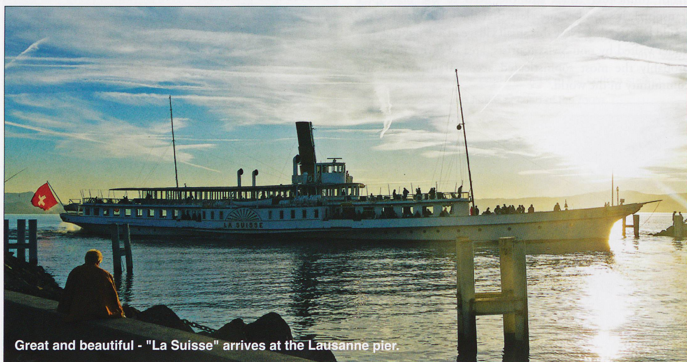
Great and beautiful - " La Suisse " arrives at the Lausanne pier.

private cars. But some of them must be lucky people - for example some of those who commute by ship across Le Léman between Lausanne and Evian-les-Bains in France. This is a busy two-way traffic as many French and Swiss travel daily in both directions to their jobs. It must certainly beat the overcrowded 07.15 from Olten - or the 08.00 from Surbiton! The Compagnie Générale de Navigation sur le Lac Léman, www.cgn.ch (CGN) normally operates large motor ships between the two cities. On their other international lines CGN uses small fast ships, but between Lausanne and