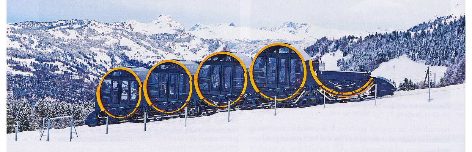
A side-on view of one of the unique 'trains'.

Ernst B. Leutwiler reports on the steepest funicular in the world!