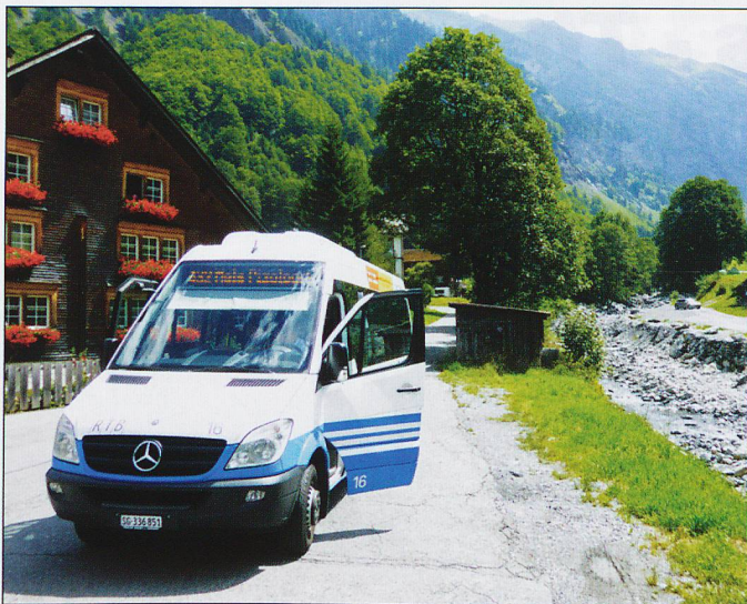
Weisstannen with the hourly service 432 awaiting departure at 13.42 to Sargens.