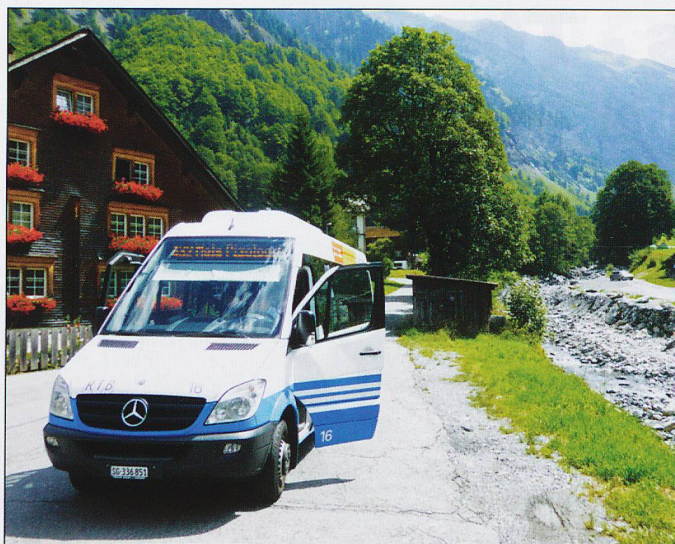
Weisstannen with the hourly service 432 awaiting departure at 13.42 to Sargens.