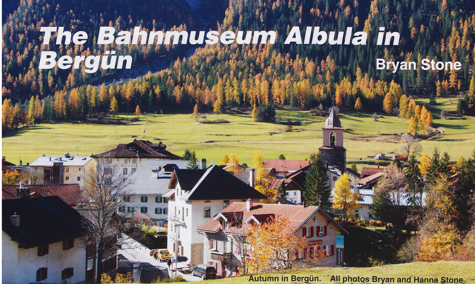
Autumn in Bergün.

The 20th October 2017 was one of those unforgettable Alpine autumn days, which make everything worthwhile! Deep blue sky, gold and brown larch forests, meadows and harvest, early snow gleaming high above, and clear sharp air. In our memories it was always so - but here it was again real. We had left home in the dark, and Basel at 07.33, to be in Bergün and in front of the Bahnmuseum Albula at 11.15 on this glorious day.