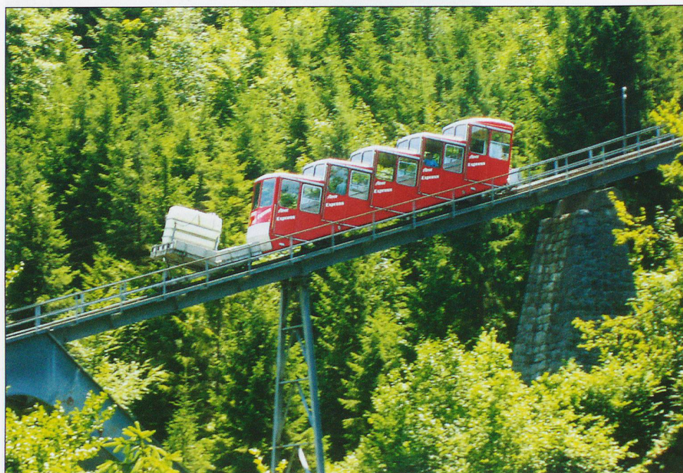
The Stoosbahn crossing a chasm.

was accepted by the Swiss Federal authorities in 1930, with the organisation being given an 80-year concession. Work on the project was completed within three years with the funicular opening on the 19th August 1933. With a maximum gradient of 78% it became one of the steepest funiculars. The line uses the unusual track gauge of 800mm, has a length of 1361m and passes through two short tunnels en-route, as well as passing over two bridges, a spectacular 60m long one over the gorge of the river Muota immediately after it leaves the base station. Like similar funiculars it has a conventional