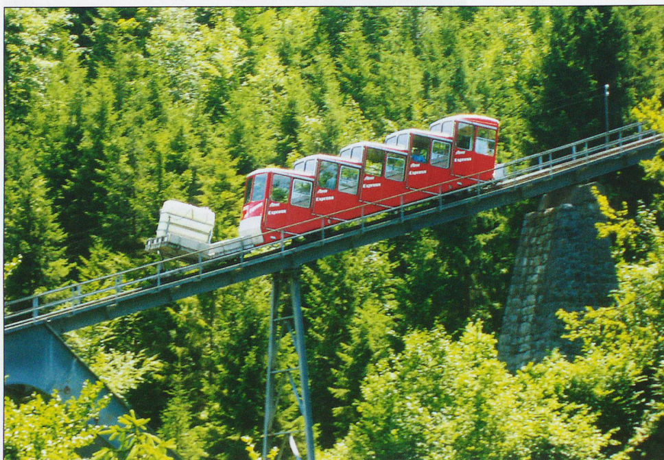
The Stoosbahn crossing a chasm.

was accepted by the Swiss Federal authorities in 1930, with the organisation being given an 80-year concession. Work on the project was completed within three years with the funicular opening on the 19th August 1933. With a maximum gradient of 78% it became one of the steepest funiculars. The line uses the unusual track gauge of 800mm, has a length of 1361m and passes through two short tunnels en-route, as well as passing over two bridges, a spectacular 60m long one over the gorge of the river Muota immediately after it leaves the base station. Like similar funiculars it has a conventional