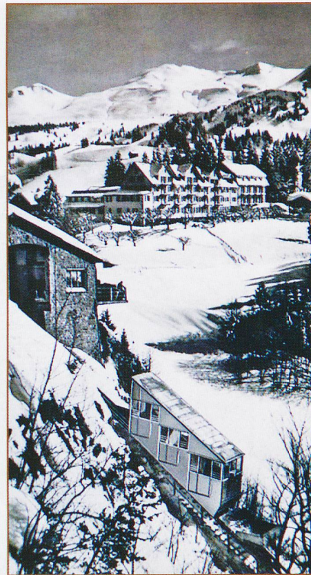
Three views of the Stoosbahn from past times.

passing loop at its halfway point. The original 50-seater cars were replaced in 1971 by new 97-seat vehicles (with an unusual stepped roof line) from Gangloff of Bern that gave the line a peak capacity of 1,000 passengers/hour. Both the original and replacement vehicles included facilities for handling freight, with around 7,000t being handled annually in addition to some ½ million passengers. At the time of the replacement of the cars the whole of the line was modernised with a new cable drive, new valley and mountain stations and a replacement bridge by the base station. With the concession due to expire in 2010 the operator commenced a feasibility study in 2004 to consider the optimum manner in which to upgrade the facility. Many options were studied and rejected and ultimately, with time running out, the Federal Office of Transport (BAV) was forced to give a 3-year extension to the franchise, and has subsequently given