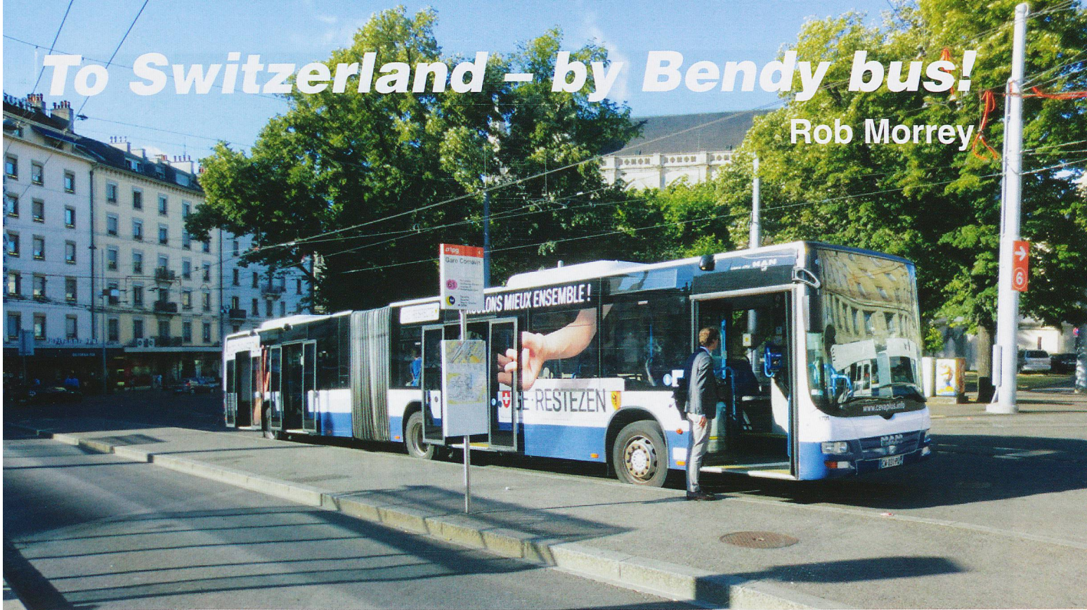
Bendy bus on Line 61 at Cornavin station in advertising livery.