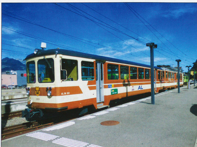
TOP: Place de la Gare in Aigle. MIDDLE: ASD 1 at Aigle. BOTTOM: An AL set at Aigle.

Vevey lakeside run. However, on this train and my return journey there were multi-lingual warnings about pickpockets as we approached Montreux. Blazing sunshine greeted me in Aigle as I proceeded to take the obligatory pictures of the three narrow-gauge lines and their TPC (Transports Publics du Chablais) stock. I am not an admirer of the snazzy new livery, so was pleased to see an AL (Aigle-Leysin) unit in the majestic brown and cream of old. Also sunbathing nearby was vintage ASD (Aigle-Sépey-Diablerets) railcar No.1 in its traditional colours.