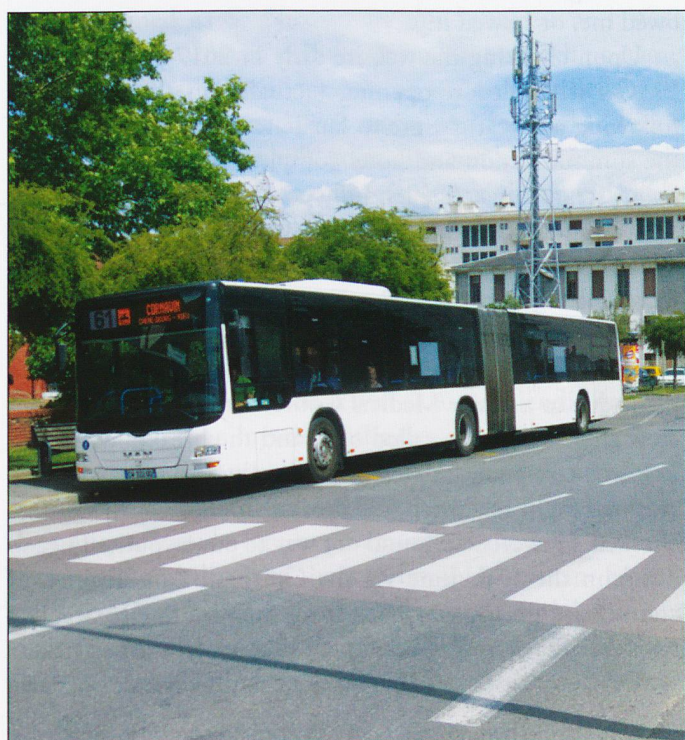
BOTTOM RIGHT: SNCF trains at Annemasse.