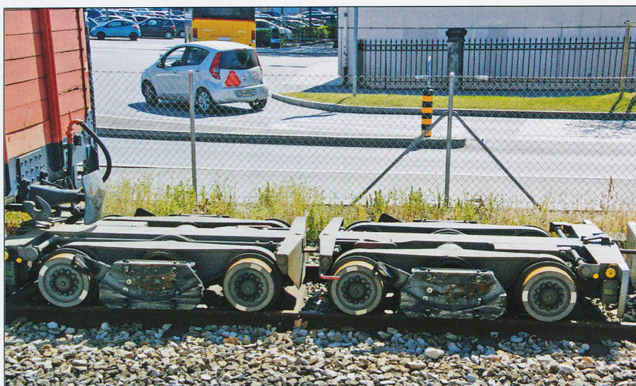
Transporter bogies in the siding at Yverdon.

A new Stadler Abe 8/12 unit waits at Ste-Croix to return back down the line.