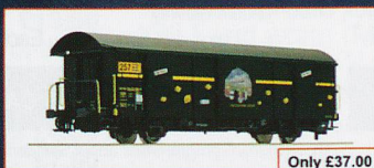
RC76208 SBB Z2 Postal Van V

This is just a small selection of the range of HO Scale new releases for 2017 representing Swiss outline railways