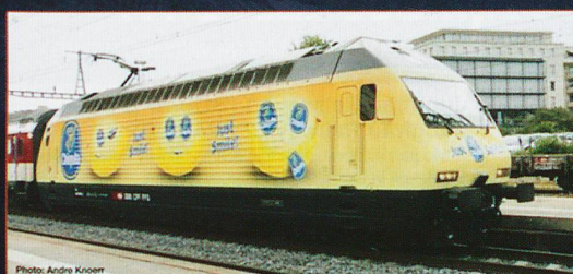
SBB Re460 029 Chiquita Electric Locomotive VI