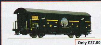
RC76208 SBB Z2 Postal Van V

This is just a small selection of the range of HO Scale new releases for 2017 representing Swiss outline railways