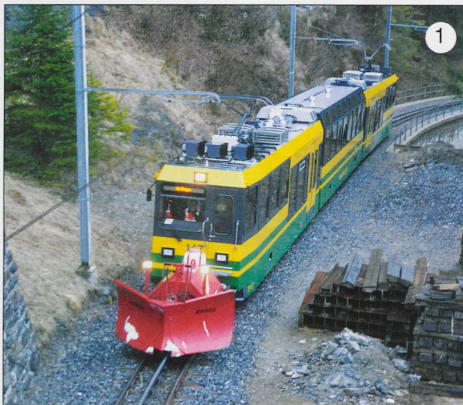
1. WAB No.147 complete with snow plough seen from overbridge at the bottom end.

Postscript: Taking the first opportunity on the Monday of the holiday due to poor skiing weather to explore these walks, instead of the Wednesday as planned, proved fortunate. An accident on the Tuesday left me somewhat disabled, but an enforced visit to the MRI scanner in Interlaken enabled me to update my photographs of Wilderswil! ☑