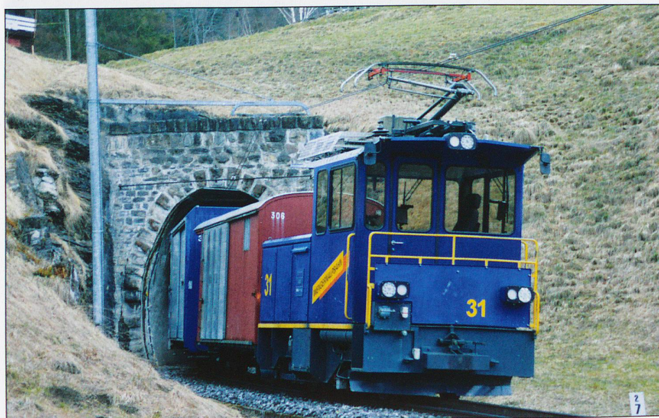
WAB No. 31 entering the Chehr tunnel.

The continued descent through the woods is steep with a very long sequence of hairpin bends, but it was never slippery. There are occasional glimpses of the BOB line immediately below Lauterbrunnen. I passed a group of half a dozen British walkers making the ascent who responded rather blankly to my 'Gruezi' and a Swiss who was actually sweeping leaves off the path. Eventually the path comes out of the woods and