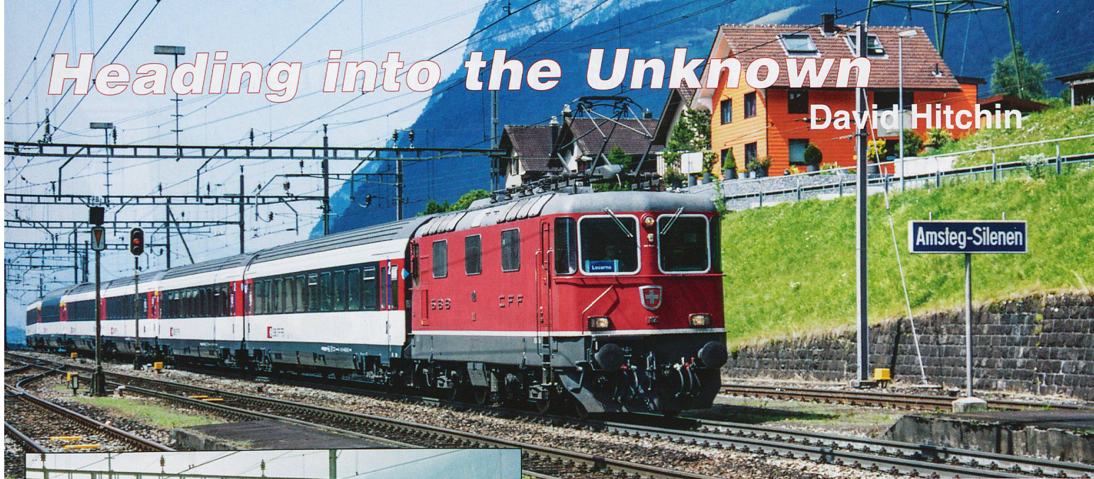
ABOVE: Showing that the loco David saw at Zurich in 1996 still runs, Re 4/4 II No. 11121 is at Amsteg-Silenen in July 2015.