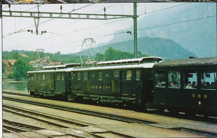
LEFT: A double headed Brunigbahn train pauses at the lakeside station at Brienz.