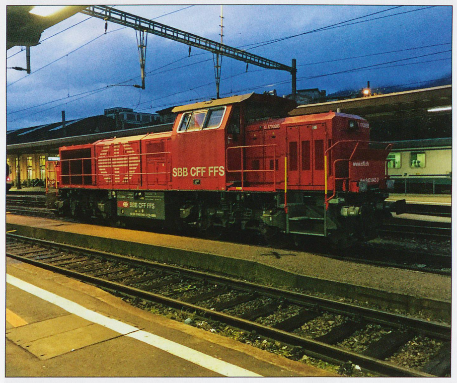
TOP: SBB Transport police on duty at Bellinzona. BOTTOM: A quiet shunter at Chiasso.

bound trip back to Bellinzona. It was clear on this trip that much of the infrastructure on both ramps of the old route is being run down. Sidings were empty, there seemed far less freight and the temporary sites were all being cleared and closed. I guess once the GBT is fully open many of these stations will be like ghost towns. I arrived back in Bellinzona just in time to enjoy the final hour of the festival, and tried many of the local cheeses and wines that stalls were offering. The station foyer was this time given over to the SBB Police. As well as offering the usual promotional freebies, they had some rather serious 'hardware' on display, including what looked like a machine gun! The bar and the kiosk in the foyer are certainly handy traveller facilities, but I found the Co-op down in the underpass to offer much better value for food and drinks.