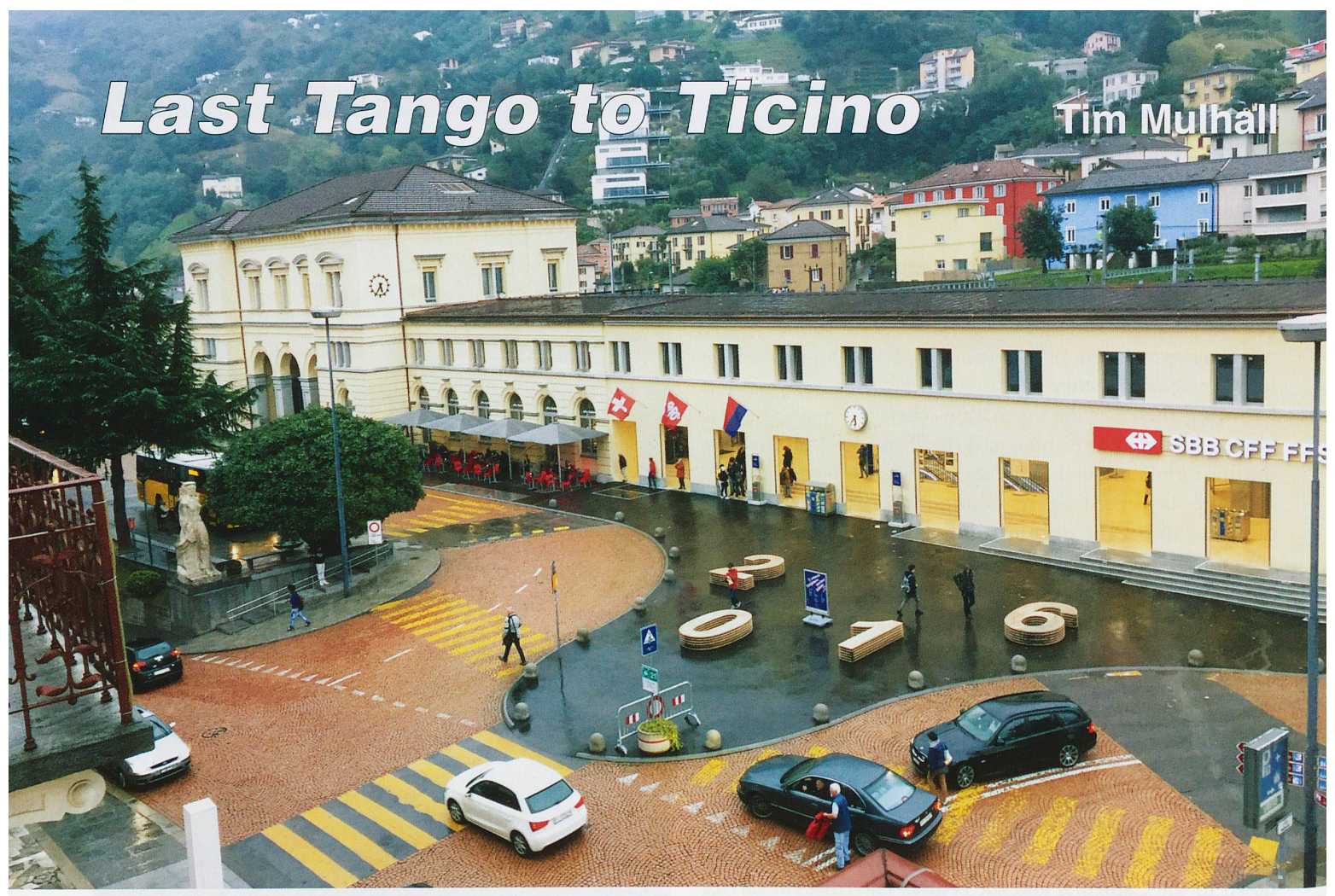
The road side view of Bellinzona station.