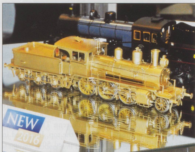
ABOVE: Railpool zebra-striped TraxX loco. TOP RIGHT: One of the Busch dioramas, showing their industrial system. BOTTOM RIGHT: One of this year's new models from the Swedish manufacturer NMJ. Not only are the models exquisite, I have it on excellent authority that they run very well.