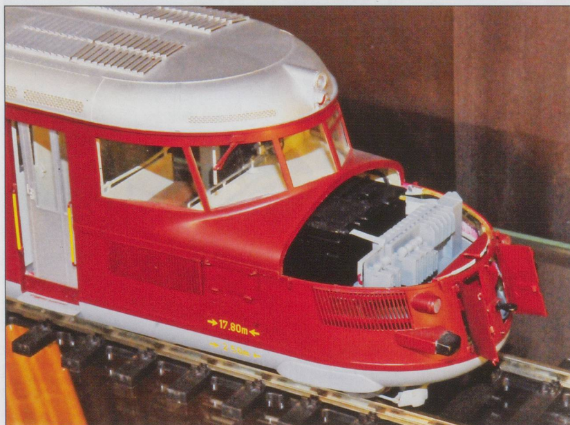
Fulgurex O gauge 'Red Arrow' with the front cover removed, showing the inside detail.

Faller, as well as introducing an impressive monastery, are making a rather dilapidated wooden structure suitable on all sorts of HO scale layouts, and also a very nice horizontal steam engine driven by an electric motor. Faller's products, and those of the other well known scenery manufacturers, are fairly easy to get hold of in Britain, but I find that it is always worthwhile taking a look at some of the less well-known names. However, some of these are now far better known than a few years ago and Artitec is one of these, whose offerings this year include a Kaelbe diesel road-roller in HO, together with small tar ovens. For both HO and N scales they make a modern fork-lift truck and a rather nice garden greenhouse. Manufacturing scale model loads for both rail and road vehicles is the niche that Bauer have