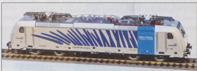
ABOVE: Railpool zebra-striped TraxX loco. TOP RIGHT: One of the Busch dioramas, showing their industrial system. BOTTOM RIGHT: One of this year's new models from the Swedish manufacturer NMJ. Not only are the models exquisite, I have it on excellent authority that they run very well.