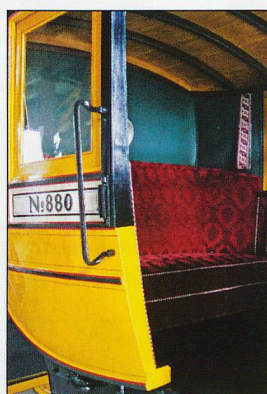
LEFT: First class part of the "Gotthardpostkutsche".

to be the most photographed object in its collection and in recognition of both its historic and current status they arranged for the comprehensive restoration to take place. For this, the diligence was moved to the museum's repair depot at Affoltern am Albis (ZH) in summer 2015, where experts from the Luzern-based conservation and restoration specialist company 'Objektgerecht' were able to use their skills. The vehicle was then returned to greet visitors to its Zürich home at the end of July 2016. There are many locomotives and trains, plus the buildings and tunnels of the original Gotthard line, to recall the story of this historic route since 1882 – but there is only this original diligence to recall the movement of people and post before the opening of the railway. +