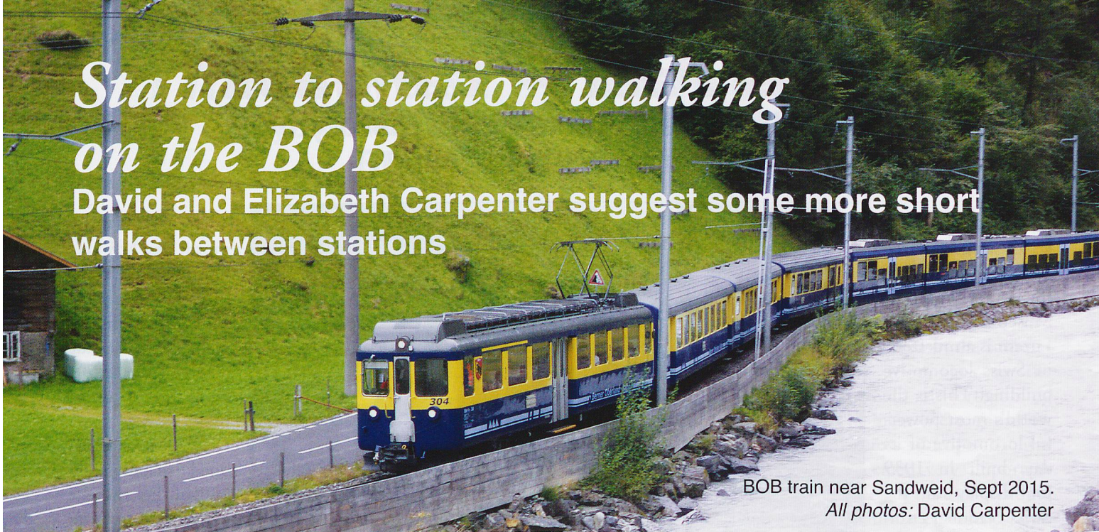
BOB train near Sandweid, Sept 2015.