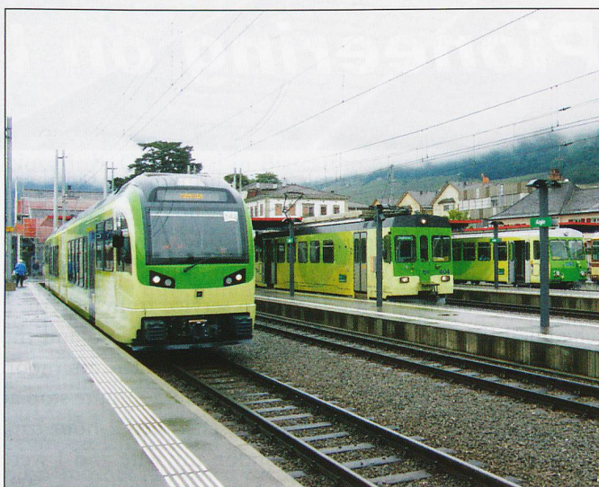
A TPC Beh 2/6 at Aigle. 02.06.16

Where's Heidi? As it's nearly Christmas, this should be an easy one so as not to tax your brains too much. Where would you see these silos? See page 43 for the answer. ☑