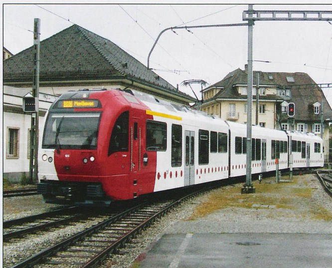
A TPF ABe 4/12 approaching Bulle. 02.06.16