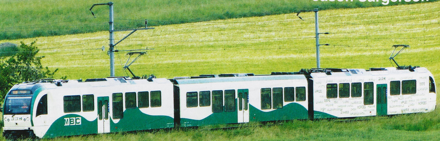
A MBC ABe 8/12 in the countryside near Yens. 04.06.16