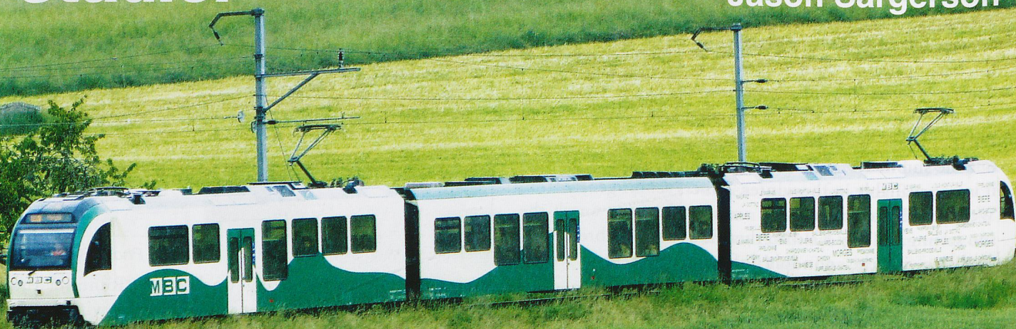
A MBC ABe 8/12 in the countryside near Yens. 04.06.16