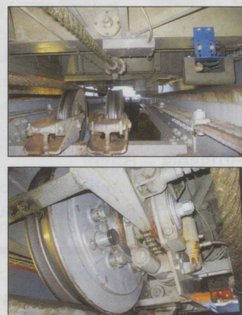
ABOVE LEFT: Full security for daily service: the engine is still in operation 100 years after construction! ABOVE RIGHT: The manoeuvring and moving parts of the two passenger cars are checked every day! BELOW: The ‘happy end’ of every visit to Seelisberg, the way back by postbus (PostAuto), or by paddle steamer.