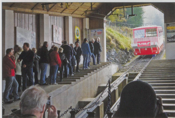
ABOVE: Lots of people visit Seelisberg and ‘Weg der Schweiz’ (“Way of Switzerland” for the 700-year-jubilee, opened in 1991). BELOW: Boat and funicular meet at Treib.