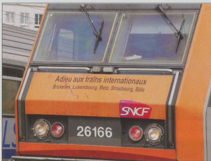
SNCF BB 26166 EC 96 IRIS BASEL BRUXELLES Dernier EC Voyageur Basel SNCF 02-04-2016.