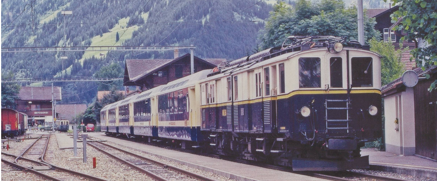
Ge6/6 No 2001 at Lenk on an early demonstration of the first Panoramic trains. No. 2001 was originally built for the 'Golden Mountain Pullman', but was used for freight and heavy duties when the GMP was abandoned.