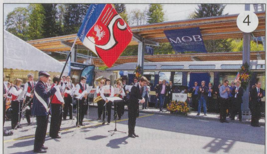
1. No. 3002 at Chamby showing the old MOB. 2. A 3000 Class at Gstaad some years previously, with Panoramic cars. The head-board for the 'Alpenpanoramic Express', a very early public use of Panoramics. 3. 'Golden Pass Classic' (Pullman replicas) leaving Gstaad. 4. The band provides some entertainment. 5. Unveiling the new coaches. 6. MOB Train drivers display their other talents.