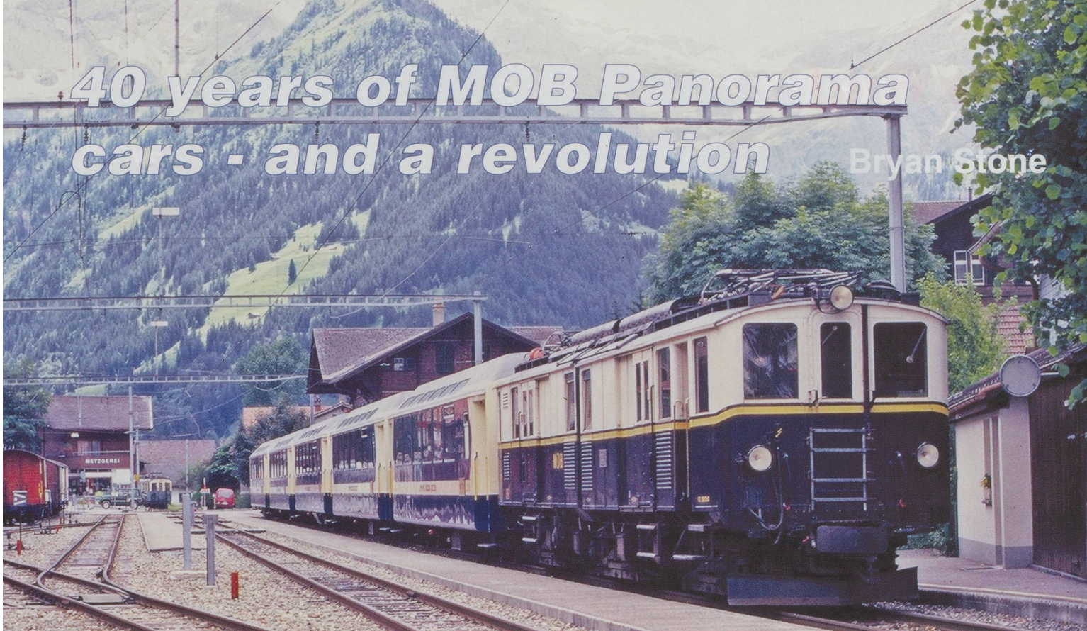
Ge6/6 No 2001 at Lenk on an early demonstration of the first Panoramic trains. No. 2001 was originally built for the 'Golden Mountain Pullman', but was used for freight and heavy duties when the GMP was abandoned.