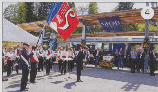
1. No. 3002 at Chamby showing the old MOB. 2. A 3000 Class at Gstaad some years previously, with Panoramic cars. The head-board for the 'Alpenpanoramic Express', a very early public use of Panoramics. 3. 'Golden Pass Classic' (Pullman replicas) leaving Gstaad. 4. The band provides some entertainment. 5. Unveiling the new coaches. 6. MOB Train drivers display their other talents.