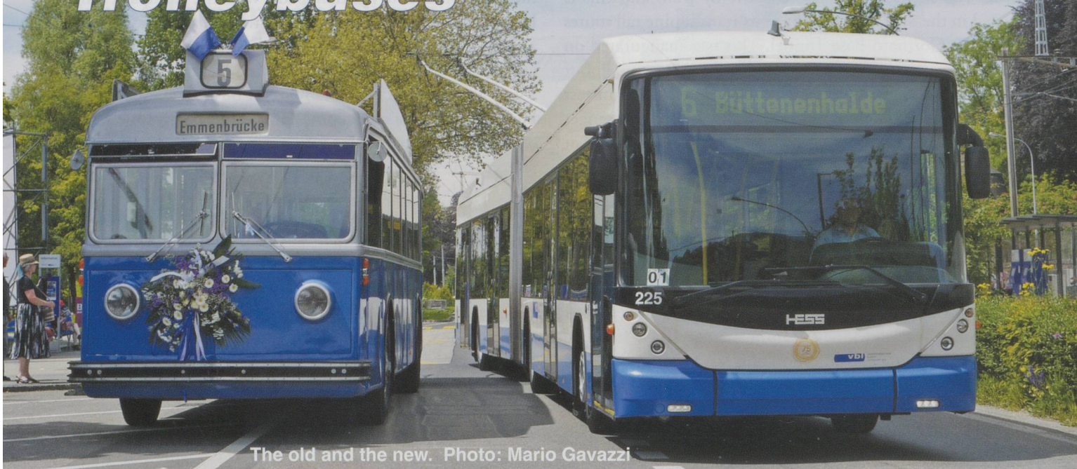
The old and the new.