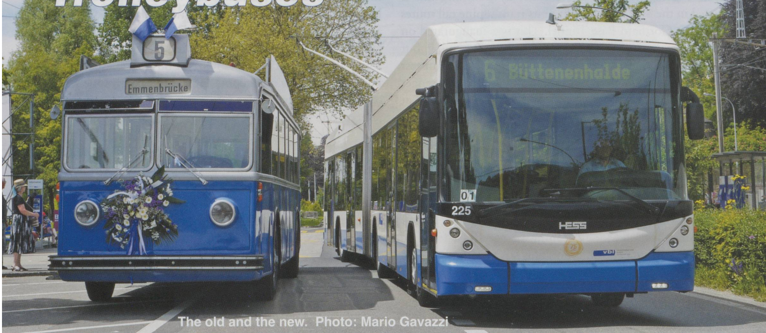
The old and the new.