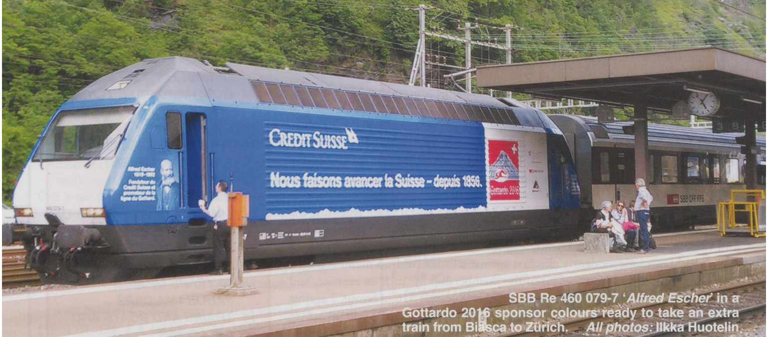
SBB Re 460 079-7 'Alfred Escher' in a Gottardo 2016 sponsor colours ready to take an extra train from Biasca to Zürich.

It took decades of debating, several referendums to get going and 17 years to build, so it was only natural that the Gotthard Base Tunnel opening would be big news in Switzerland. It was officially opened on 1st June followed by a special party for the 2,400 people involved in the construction, and on the following weekend there were a series of events for the general public, which I had a chance to attend. The opening party had been announced exactly one year in advance, followed up with regular updates in the media in the build up to the big day, and the attention it got was great across the whole country. The Swiss are typically very locally focused and not much interested in what happens elsewhere, especially across the language borders, but the official opening event was extensively broadcast live in the three different national languages, for the whole day. The Federal Government had spent CHF12m on the events, and if one counts expenditure by the Cantons, Communes and sponsors the total figure will be much higher.