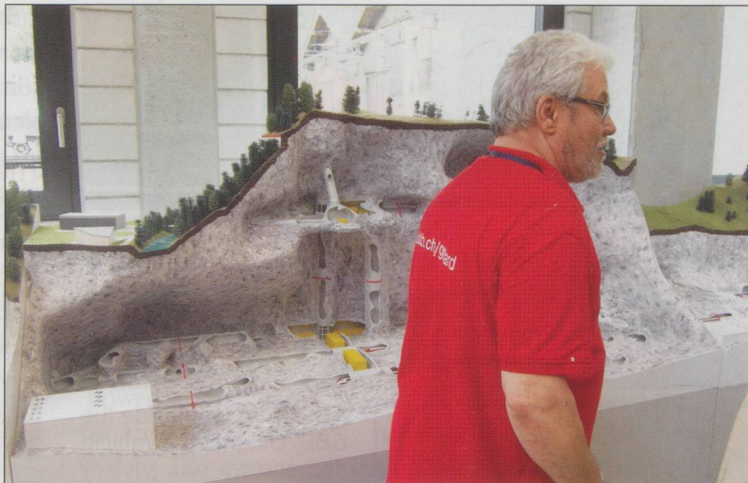
The model of the base tunnel system being demonstrated at the Erstfeld maintenance centre. It is used in the training of employees and emergency services.

Biasca was the second site with a large collection of trains. Just a few days before the event, a risk of a landslide was detected next to the freight yard and the trains were relocated