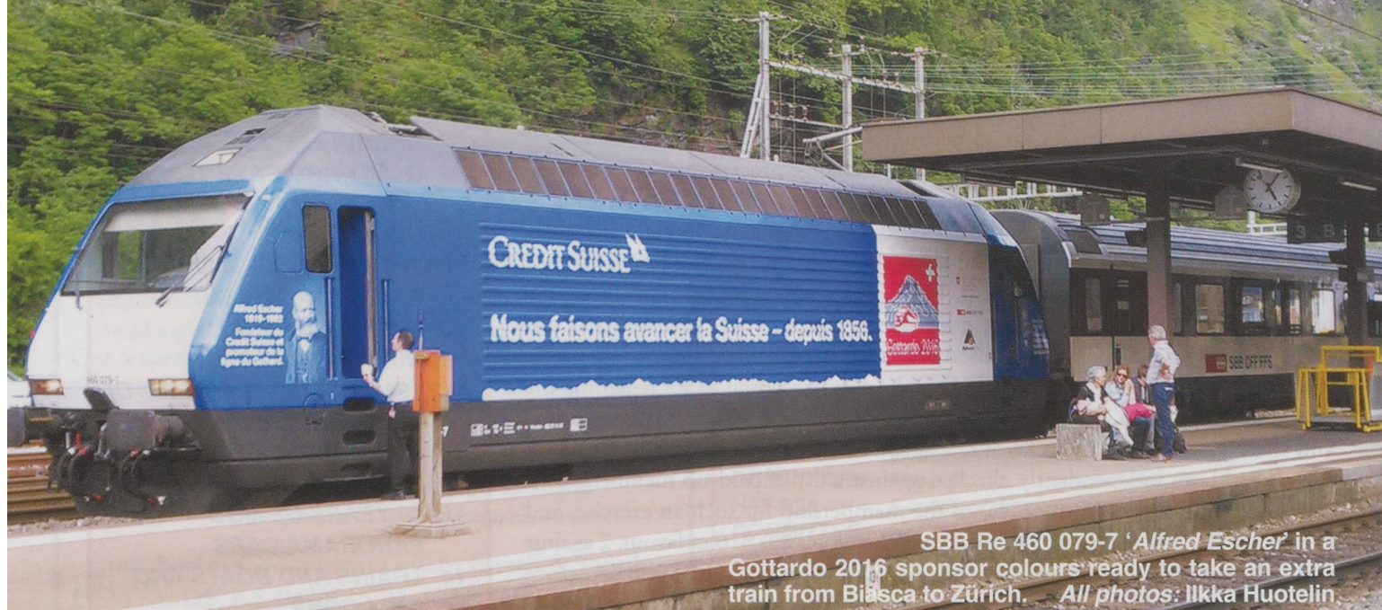
SBB Re 460 079-7 'Alfred Escher' in a Gottardo 2016 sponsor colours ready to take an extra train from Biasca to Zürich.

It took decades of debating, several referendums to get going and 17 years to build, so it was only natural that the Gotthard Base Tunnel opening would be big news in Switzerland. It was officially opened on 1st June followed by a special party for the 2,400 people involved in the construction, and on the following weekend there were a series of events for the general public, which I had a chance to attend. The opening party was had been announced exactly one year in advance, followed up with regular updates in the media in the build up to the big day, and the attention it got was great across the whole country. The Swiss are typically very locally focused and not much interested in what happens elsewhere, especially across the language borders, but the official opening event was extensively broadcast live in the three different national languages, for the whole day. The Federal Government had spent CHF12m on the events, and if one counts expenditure by the Cantons, Communes and sponsors the total figure will be much higher.