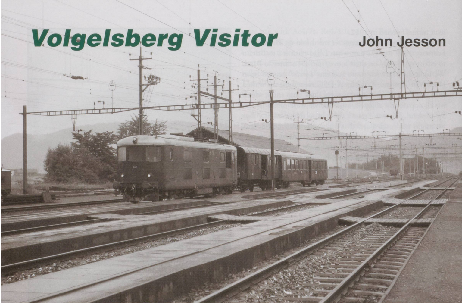
SBB Bm4/4 II No.18451 on a passenger train from Singen at Etzwilen.