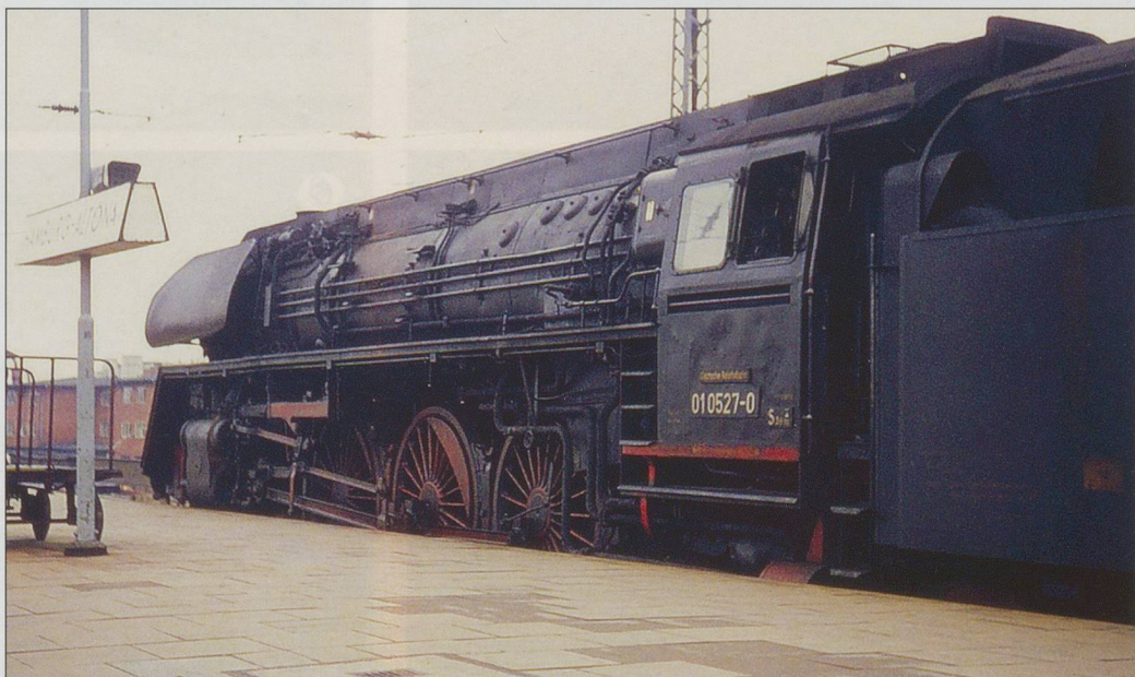
DB 01 No.0527 at Hamburg Altona.

Holidays with the family were in Berner Oberland or Graubünden. I find a note that on the Brienzer Rothorn Bahn on a good day, locomotives Nos.1,2,3,4,5 and 7 all left in convoy on a late morning departure; previously No. 6 had taken the 10.19. There were no reserves; all were up the mountain. Today Nos.3 and 4 have been stored for many years out of use, but who thought we would have four new engines built in 1996? Although SBB steam finished in 1968, there were still a number of industrial and private (often ex-SBB) locomotives in regular use. Emmenbrücke, Chippis, Choindez, Reuchenette, Winterthur, Domat-Ems and others could all reward a searching look. The Blonay-Chamby Museum Railway opened in 1968, and we soon found it. Most Swiss main lines