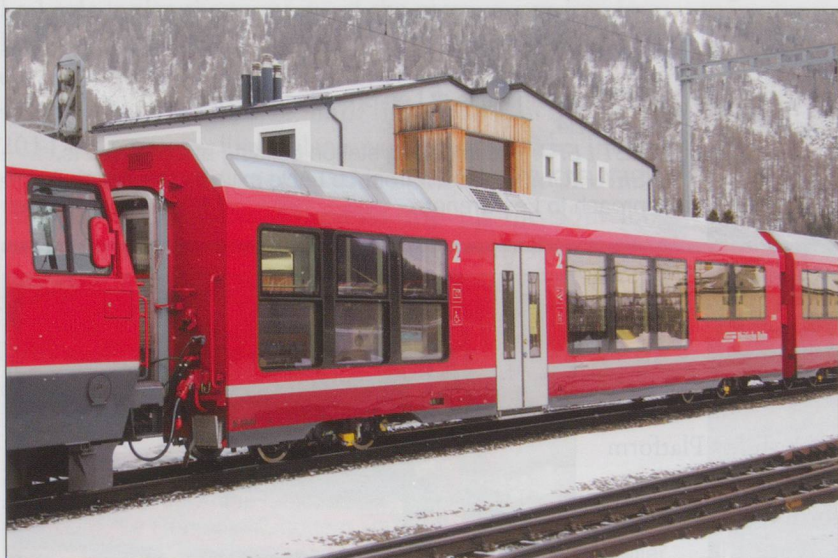
Coach Bi 57601.

When we were in Graubünden we used the BÜGA monthly ticket. Although valid for a month this can work out cheaper even if only using it for a week or two. The 2nd Class monthly ticket is CHF 220 (£156) whilst 1st Class is priced at CHF330 (£234), which for our 12-day stay only worked out at CHF27.5 a day (under £20) a bargain. We were often the only people in a 1st Class coach and this is useful if you want the drop down windows open for a photo opportunity. A single ticket on SBB to take you from Zürich Airport to