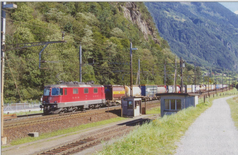
Re 4/4 banker at Erstfeld 6/9/2007.

There are several factors that will impact greatly on Hupac over the next few years. The opening of the NEAT Gotthard base tunnel through the alpine massive will dramatically improve transit times, reduce costs, and therefore improve competitiveness. There will be reforms to the railways of Switzerland and elsewhere, which are expected to improve services and costs, and there could be financial contributions to the infrastructure at terminals. It is also anticipated that, as a result of environmental pressure, there will be tax exemptions for road hauliers who use rail for part of their journey. For several years now Hupac has seen its traditional trans-alpine traffic stagnate, due to both capacity problems on routes through Switzerland, and worsening operational restrictions on access routes through Germany