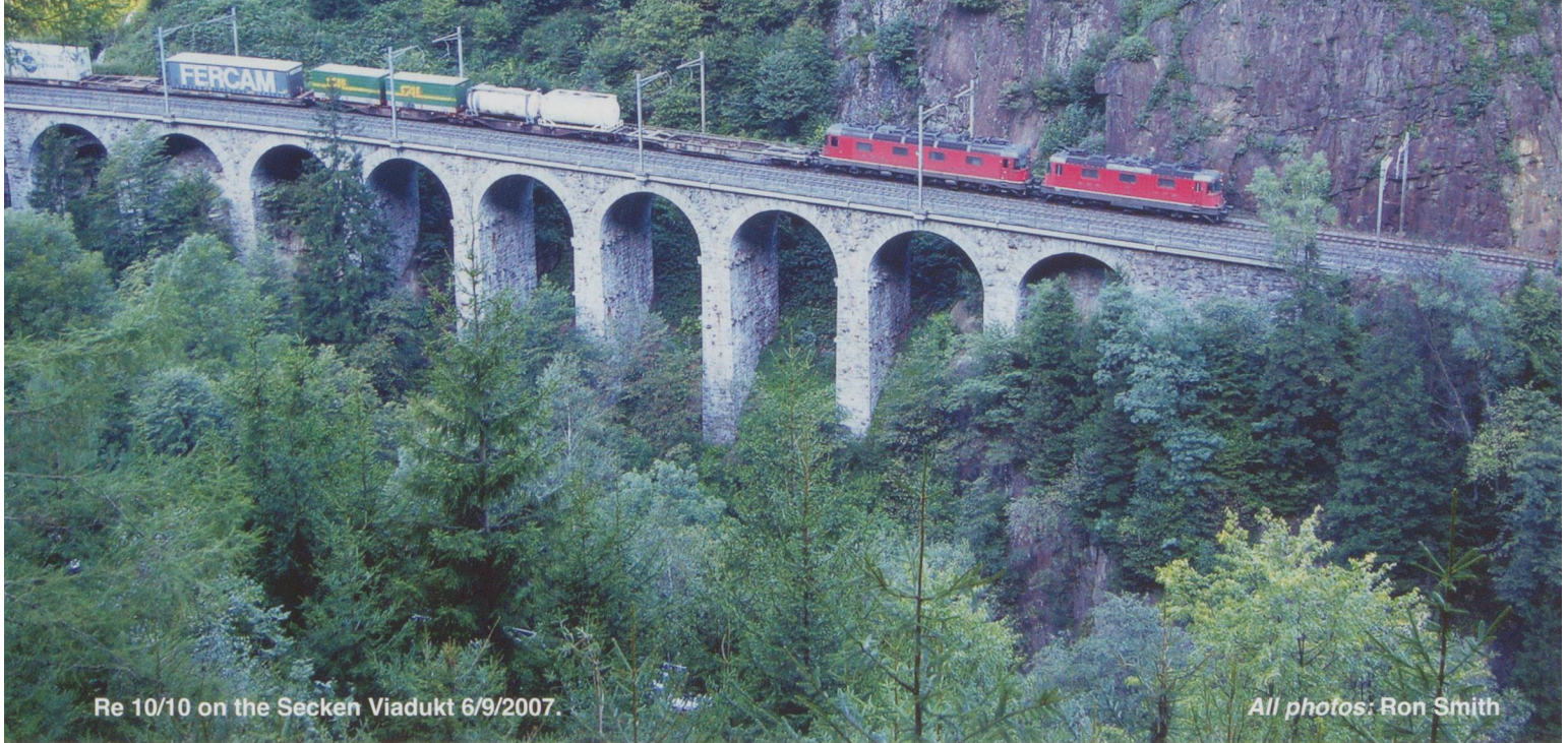
Re 10/10 on the Secken Viadukt 6/9/2007.