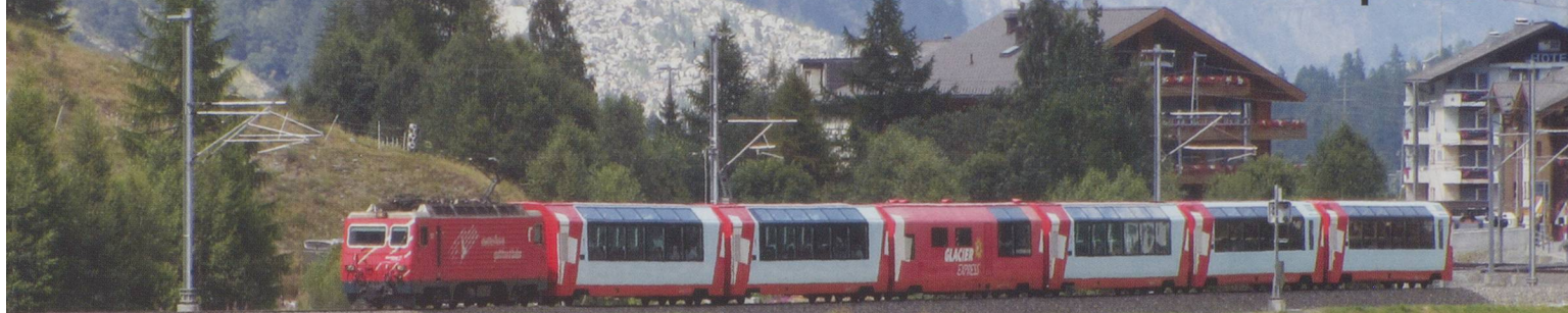
ABOVE: A MGB He 4/4 II heads a Glacier Express past the well-known rockfall at Täsch.