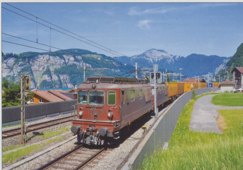
BLS Re 4/4 No.177 +1 at Sisikon 11 July 2015.

The amount of traffic traversing the line was phenomenal. While at Amsteg-Silenen one afternoon there were about sixteen trains in some eighty minutes (about one every five or six minutes), and quite often at Göschenen there were five or six trains in quick procession. Freight trains, nearly always double, triple, and sometimes quadruple, headed (and sometimes with a banker a well), were operated by various operators, including SBB, BLS, DB and Crossrail. Re4/4s and Class 460s hauled passenger trains on the IR Basel/Zurich Locarno services, RABDe500s on the IC Zürich-Chiasso service, and ETR470s and ETR610s (RABe503s) on the EC Zürich-Milan services. The ETR470s were an added bonus, as they should have been withdrawn by the time I was there. Three were in regular service all in FS livery and I even managed a final ride on one from Lugano to