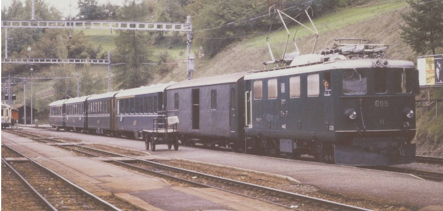
Filisur RhB Davos train with open door and typical station barrow.