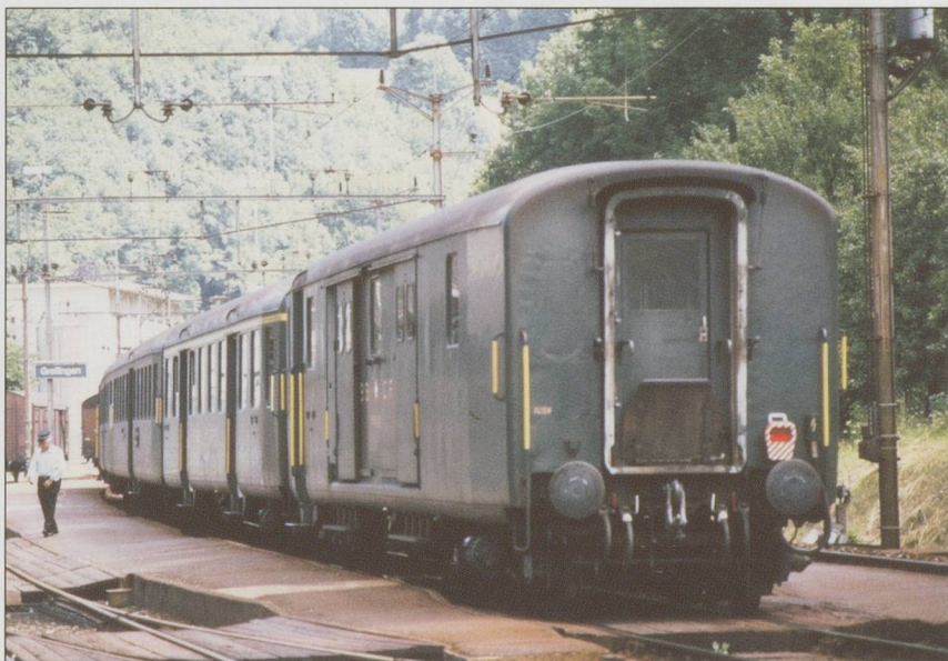
LEFT: SBB, Grellingen, 1998, Delémont – Basel local, classic EW 1 baggage car (also with open door!).