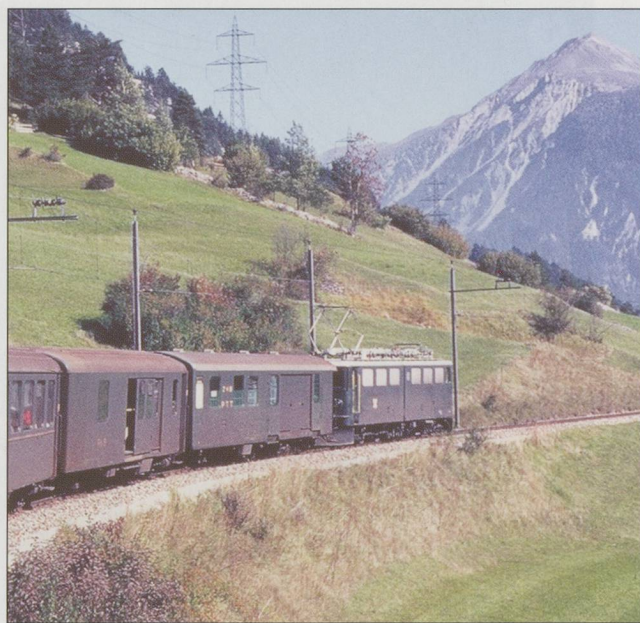
RhB Chur – St Moritz express 1967, the open door and also the postal car.