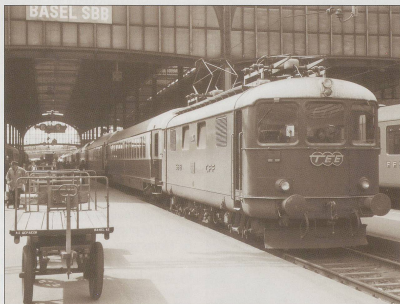
SBB TEE Rheingold 1965 when it went to Genève. Note the Station barrows and left, a porter.