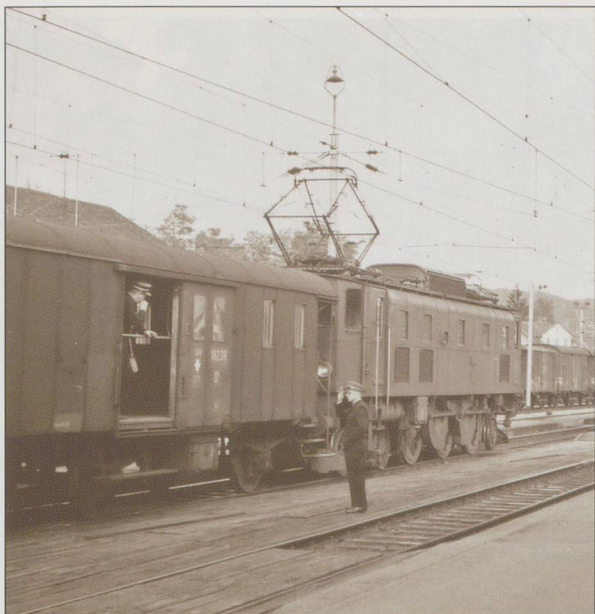
SBB Bülach 1964, again the open door and a lucky conductor.