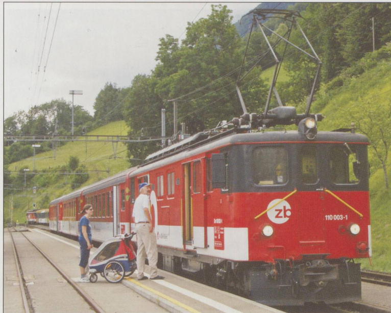
Zentralbahn, Oberried, 2013, using a redundant baggage compartment to help a passenger with a bike and trailer.