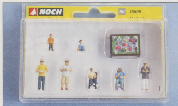
Railway modellers by Noch!

Noch is well known for producing a large range of figures for modellers in all of the popular scales but these two packs are a little different. One is a set of railway modellers and the other is of Swiss station personnel, one of whom carries an illuminated train despatch disc. There are seven railway modelling figures including two children. Four of the figures are wearing glasses and three of them are holding controllers.