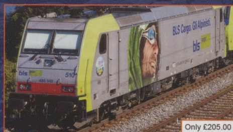
RC73651 BLS Cargo Re486 Electric Locomotive VI

Roco products are available from your local model shop or, in case of difficulty, direct from ourselves GAUGEMASTER Controls Ltd, Gaugemaster House, Ford Road, Arundel, West Sussex, BN18 0BN, United Kingdom tel 01903 884488 fax 01903 884377 email sales@gaugemaster.co.uk