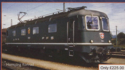
RC72584 SBB Re6/6 Electric Locomotive IV

This is just a small selection of the range of HO Scale new releases for 2014 representing Swiss outline railways