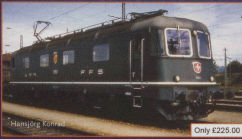
Hansjörg Kohrad Only £225.00 RC72584 SBB Re6/6 Electric Locomotive IV

This is just a small selection of the range of HO Scale new releases for 2014 representing Swiss outline railways