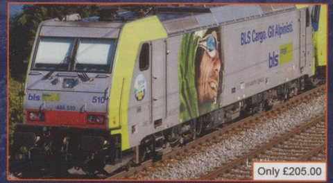
Only £205.00 RC73651 BLS Cargo Re486 Electric Locomotive VI

Roco products are available from your local model shop or, in case of difficulty, direct from ourselves GAUGEMASTER Controls Ltd, Gaugemaster House, Ford Road, Arundel, West Sussex, BN18 0BN, United Kingdom tel 01903 884488 fax 01903 884377 email sales@gaugemaster.co.uk