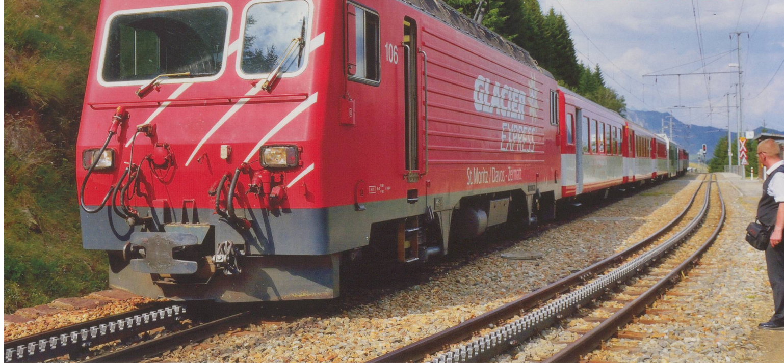
MGB HGe 4/4 No. 106 waiting at Tschamut-Selva to be rescued, with the guard looking on.