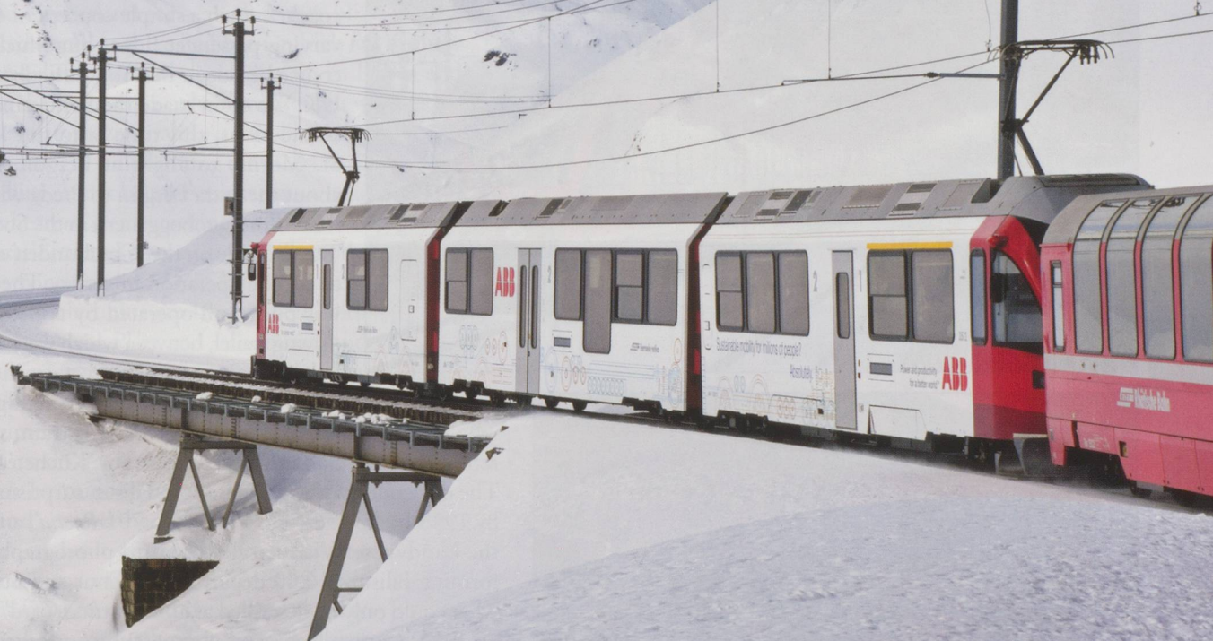
'Deep and Crisp and Even'..., 'Allegra' Class 8/12 unit No.3512 in ABB (now Bombardier) advertising livery, heads the 11.00 Tirano – St. Moritz train through a magical landscape near Ospizio Bernina on 6 February 2015.

Like many railway enthusiasts of a 'certain age' my introduction to Swiss Railways was via the late George Behrend's classic book 'Railway Holiday in Switzerland' first published in 1965. Many years later I finally travelled to Switzerland on an organised package tour, then once it was apparent how easy it was to travel in a country that loved its railways - and where everything connected to provide a fully integrated public transport network - I have travelled independently on many occasions. However, there was still one period of the year that I had dreamed of visiting Switzerland - in winter! When staying at the Grishuna Hotel in Filisur in summer 2014 the owner, Anna, advised that the best time to see snow in that area would be February. The Rhätische Bahn (RhB) is without doubt my favourite railway, so I was overjoyed to find my Christmas present from my wife was a four-night stay in the Grishuna in early February 2015. The hotel was well