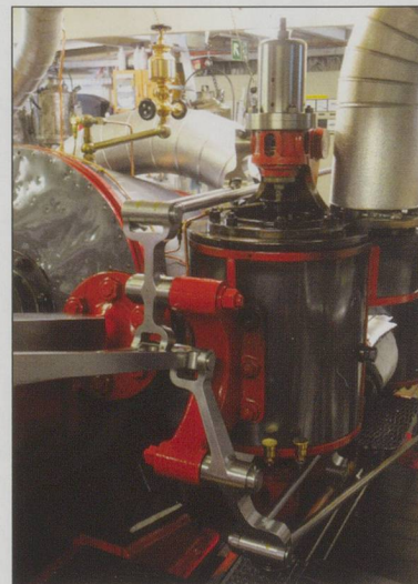
High pressure valve chests.