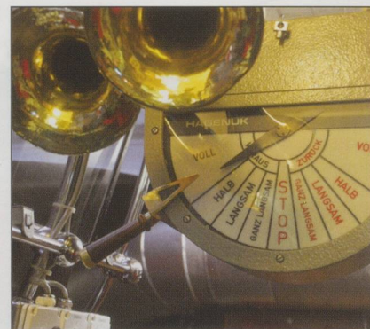
Speaking tube and telegraph to the bridge.

Like most Swiss lake paddle steamers, the 'Uri' is powered by a 2-cylinder compound engine. A link motion controls steam admission to each cylinder. A single wheel alters the position of both cut-offs simultaneously, but they are not in a fixed ratio. In forward the high-pressure cut-off is always shorter than the low-pressure, but it is the other way round in reverse. Vertically acting piston valves control the high-pressure cylinder, and slide valves, acting on a vertical surface, control the low-pressure cylinder. A