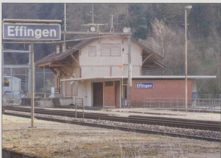
Effingen station. The name board still serves as a time keeping marker for train crews.