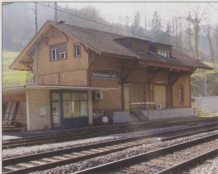
Schinznach Dorf station.

today a private dwelling. A small office with signalling equipment still exists to control the currently mothballed clay loading siding. The modern toilet block exists but is closed. As in Villnachern, the platforms have been ripped up. The pedestrian subway is still open and is used by occasional hikers.