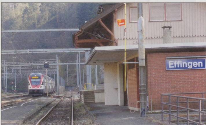
BELOW: Zurich Airport – Basel train passes Effingen at speed.