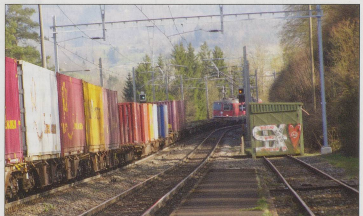
ABOVE: Container train passing Hornussen station. The Land Rover shunter for the scrap merchant is housed in the shed to the right.