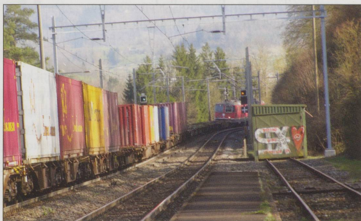
ABOVE: Container train passing Hornussen station. The Land Rover shunter for the scrap merchant is housed in the shed to the right.

The Bözberg line today has two InterRegio passenger trains each way per hour as well as a host of freight trains. Since it is one of the routes from Basel to the Gotthard, numerous companies operate over this route so a variety of motive power can be seen. One can view the operations in comfort from the eclectic 'Rösti Farm' restaurant that is adjacent to Schinznach Dorf station. +