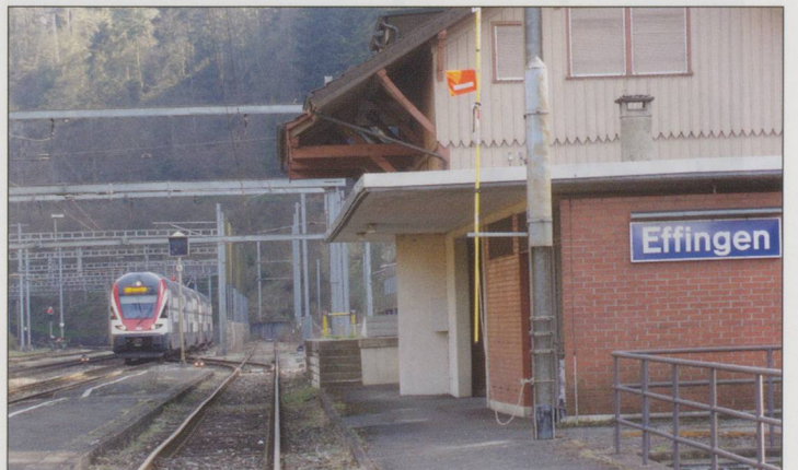
BELOW: Zurich Airport – Basel train passes Effingen at speed.