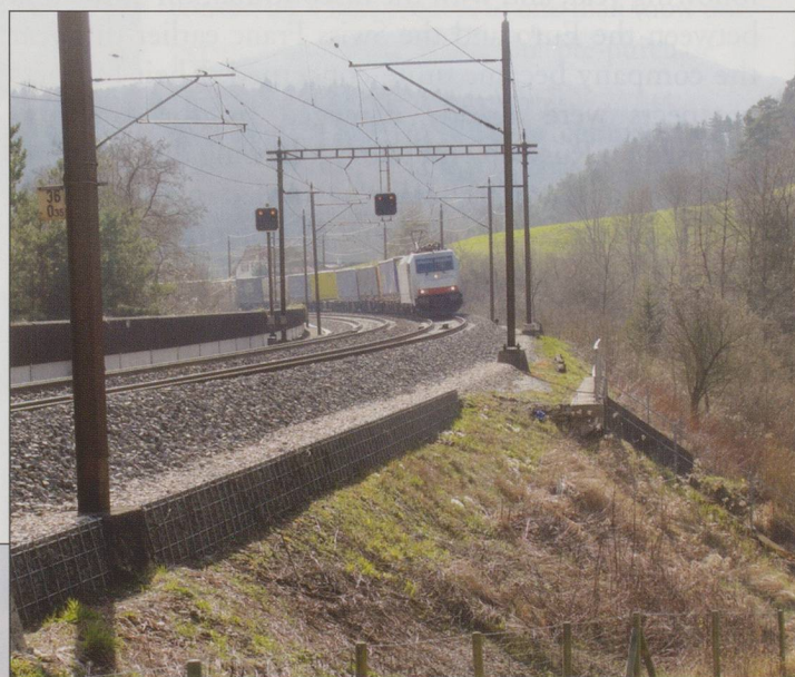
ABOVE: Crossrail container train is seen approaching the site of Villnachern station.

The SBB ripped up the platforms and removed the waiting room. The pedestrian subway exists and public toilets are still available in the wooden house north of the tracks.