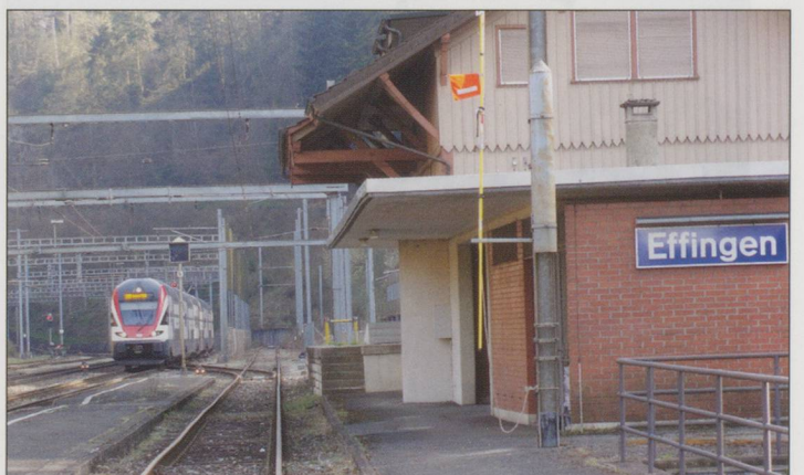
BELOW: Zurich Airport – Basel train passes Effingen at speed.