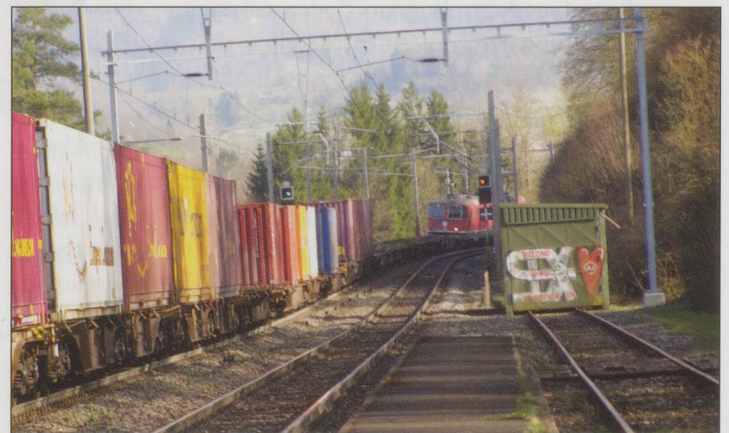
ABOVE: Container train passing Hornussen station. The Land Rover shunter for the scrap merchant is housed in the shed to the right.