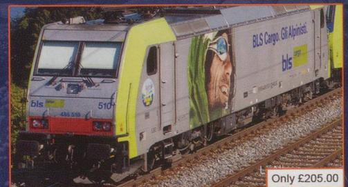
RC73651 BLS Cargo Re486 Electric Locomotive VI Only £205.00