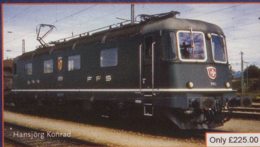
RC72584 SBB Re6/6 Electric Locomotive IV Only £225.00

This is just a small selection of the range of HO Scale new releases for 2014 representing Swiss outline railways