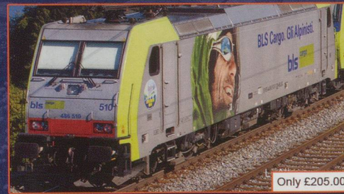
RC73651 BLS Cargo Re486 Electric Locomotive VI