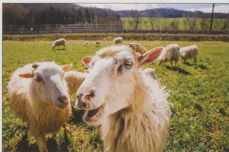
"We are the sheep!"

S BB has some 2,700ha of embankments and cuttings, an area equal to 3,800 football pitches. Keeping these trimmed and stable is a big and costly task. In the interest of sustainable resource use, and efficient operations, SBB have arranged with Pro Specie Rara, an association which helps preserve rare, historic and threatened species, that flocks of sheep will in future be used, under expert supervision, at various locations. The breed of sheep to be used is unusual. They are 'Skuddn' sheep, originally from Estonia, Lithuania and the former German East Prussia, and are believed to be an early Celtic breed, and accustomed to hard conditions, but by 1970 they had almost died out. Subsequently they have been bred in Germany and Switzerland and are now well established again. SBB expects that a single small flock can clear 1000 m 2 (1ha) in a 22-hour working day – apparently the sheep only sleep for 2 hours a day! Additional advantages are that by being selective feeders