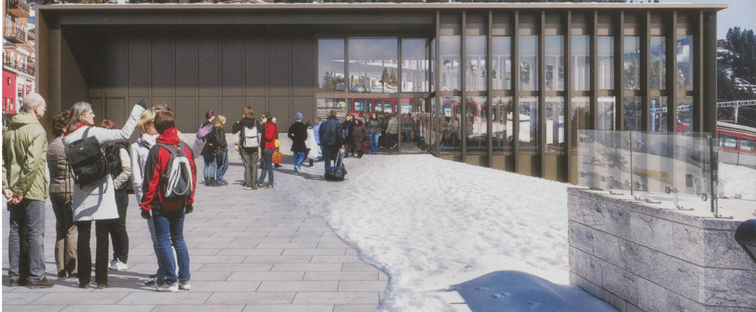
The new building at Rigi Kaltbad.