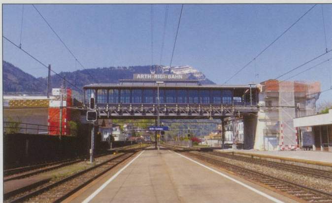
The Rigi station over the main line at Arth Goldau.

Behind the scenes there is also much infrastructure work to be done. The on-going programme to convert the sub-stations to accept regenerated electricity continues, and three out of the five rectifiers are now working this way. The routine repair and replacement of overhead catenary is another on-going project, as is the refurbishment and maintenance of rolling stock. For example power car ARB No.6 had CHF102,000 spent on it. It is still planned to replace the older power cars Nos.1 to 5 with a new type of loco/train combination, capable of working efficiently with historic stock as well as new coaches and goods wagons. However, this project is not urgent and must take its place in the list of priorities, and it will possibly be 2020 before it is started. The rebuilding of the cable car from Weggis to Kaltbad, especially with new pylons, is going ahead in 2017 / 2018. In 2018 it will celebrate 50 years of operation, and it is hoped to have spectacular new cars