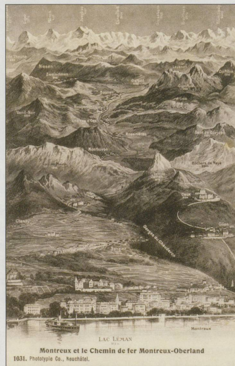
Panorama showing the route of the MOB from Montreux.