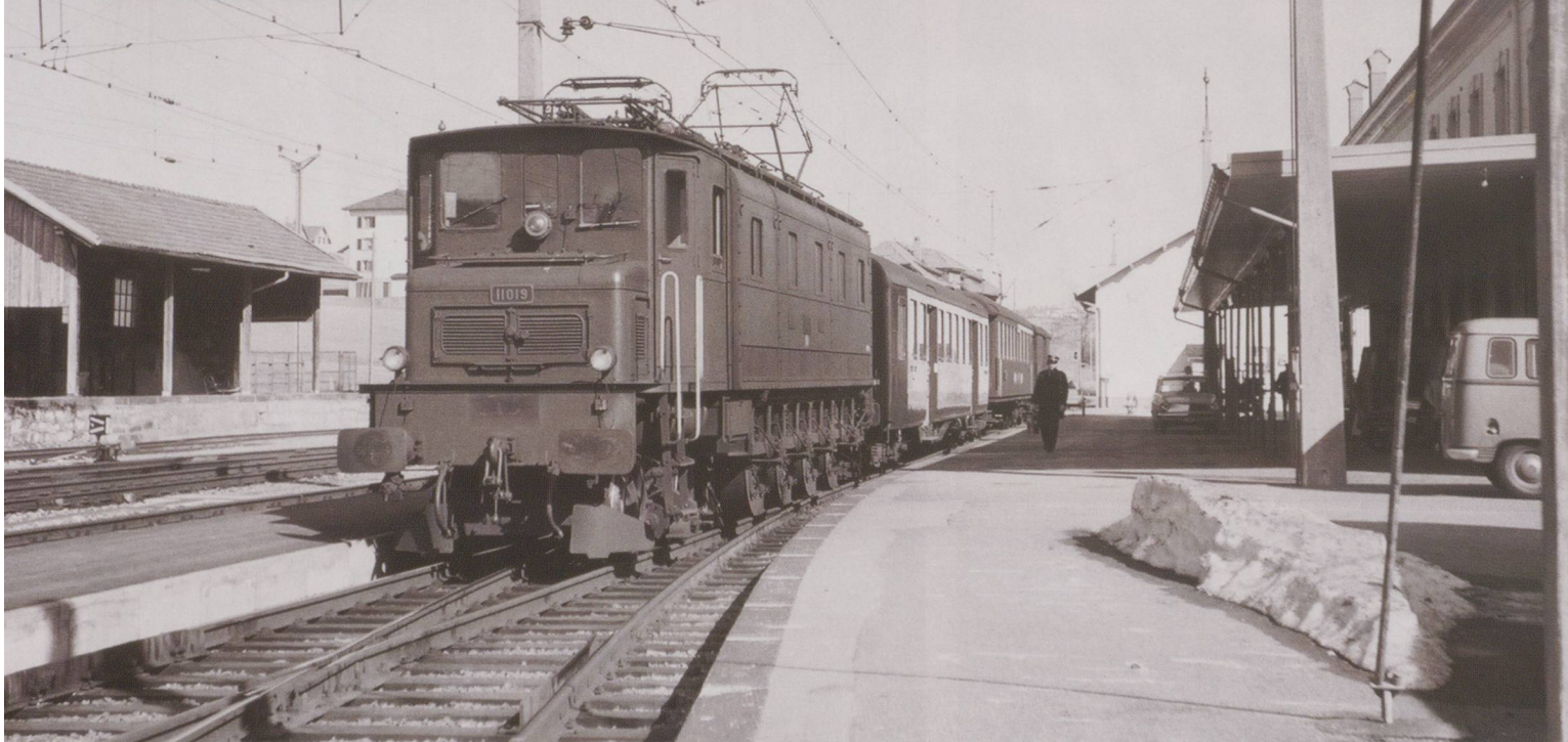
Ae4/7 No.11019 on a local from Neuchâtel, at Les Verrières, where all local services were withdrawn.

Part 2 of Bryan Stone's look at the closing of railways in Switzerland