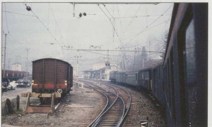
BELOW: Weesen: station seen from Chur – Zürich express in 1968, just before closure as part of major realignment from Ziegelbrücke to Walensee. A new Weesen station was built on the new line but is, since 2012, also closed.