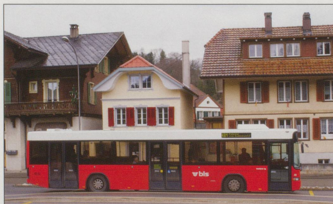
BELOW: BLS bus (rail replacement) at Sumiswald-Grünen.

No different reason, increasingly to be found: it connected the Seetal line at Wildegg to a main line between Aarau and Zürich. The Heitersberg tunnel of 1975 meant that the fast connections were now made at Lenzburg; Wildegg was redundant. Closure was controversial, because the 'Hero' conserves factory that generated heavy freight traffic, was on the line. It did close and the whole is almost effaced by inner-urban highway improvements. Removal of lines no longer justified following modernisation had taken place previously. In 1960 the opening of the Kerenzerberg Tunnel saw a section of the line alongside the Walensee closed and this was followed in 1969 by the going of the old line through Weesen. The line from Weesen to Näfels-Mollis had gone thirty eight years earlier! Although not a proper line 'closure', many readers regretted the withdrawal in 1987 of stopping services between Kandersteg and Frutigen, including Blausee-Mitholz. They were an undoubtedly ineffective use of line capacity when the BLS was full; but now that the 'Lötschbergers' are the only regular trains over the old line, there is talk of serving more stations again. The SBB did the same thing in 1994 with the stopping trains between Erstfeld and Bellinzona; most stations were closed, but perhaps they only sleep until the Gotthard base tunnel opens.