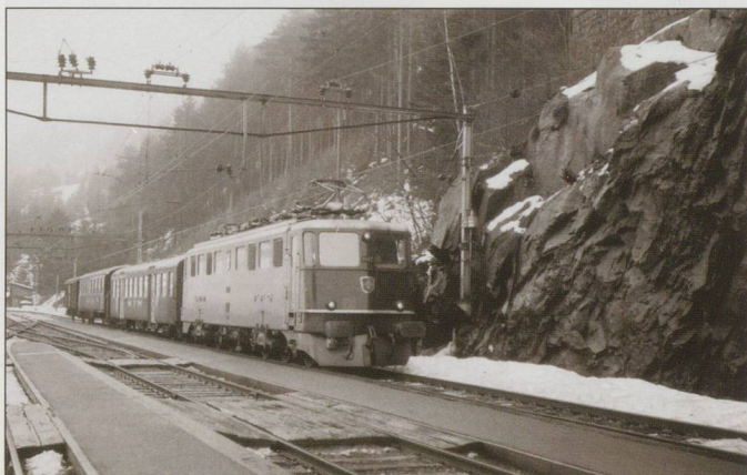
ABOVE: Ae6/6 No.11467 at Wassen on the Gotthard-Rampe on a local train from Luzern to Göschenen. The intermediate stations from Erstfeld were all closed in 1992.