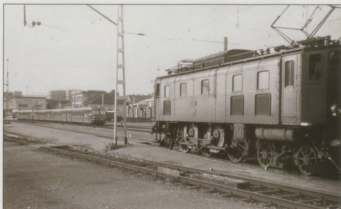
BELOW: No.1667 at Emmen.