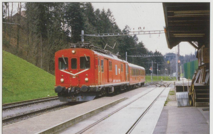
ABOVE: Wasen im Emmental: a local train in 1995 on the now closed branch from Sumiswald.