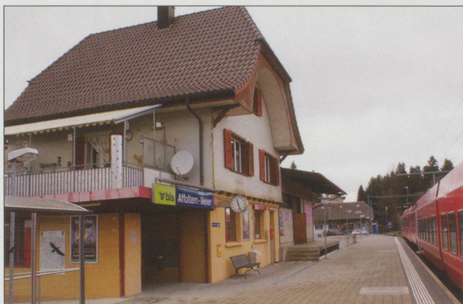
Affoltern-Weyer, in the closing days in 2009.