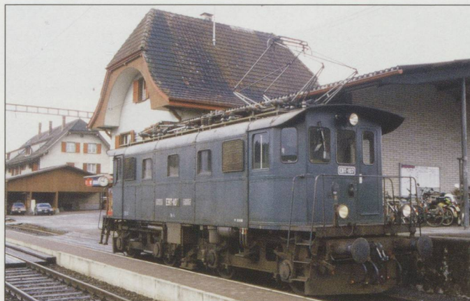
BLS No.107 at Affoltern-Weyer: this is on the line closed in 2009 between Sumiswald and Huttwil.

Ae 3 III No.10456 and 1041 at Winterthur, in 1965, No.1041 is on the regular fast service between Winterthur and Basel, service later withdrawn on closure of the section Laufenburg - Koblenz.