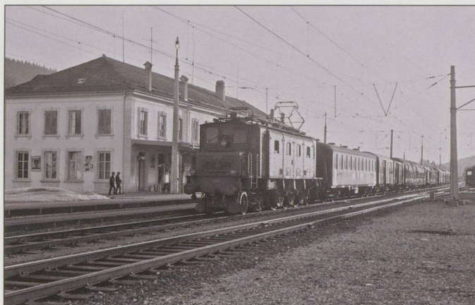
Ae3/6' No.10708 on mixed train from Pontarlier, France, at Les Verrières.