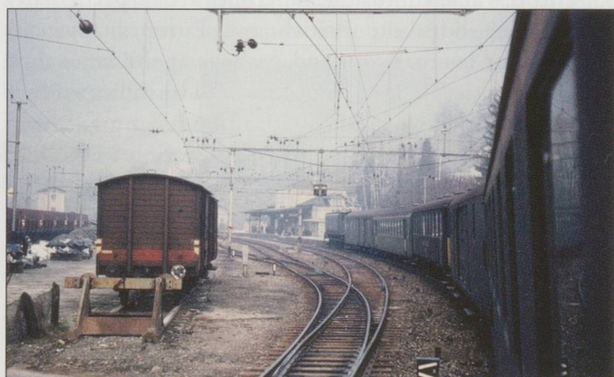
BELOW: Weesen: station seen from Chur – Zürich express in 1968, just before closure as part of major realignment from Ziegelbrücke to Walensee. A new Weesen station was built on the new line but is, since 2012, also closed.