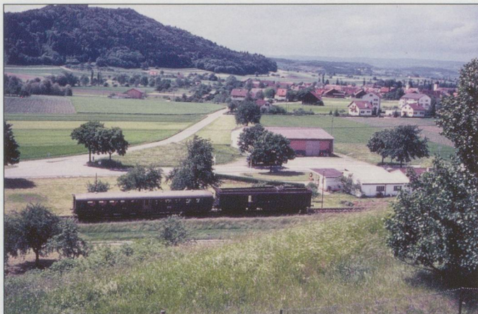
Bm 2/4 No.1692 Diesel railcar, and a passenger car, on the Singen – Etwilen line, never electrified and closed in 1969.