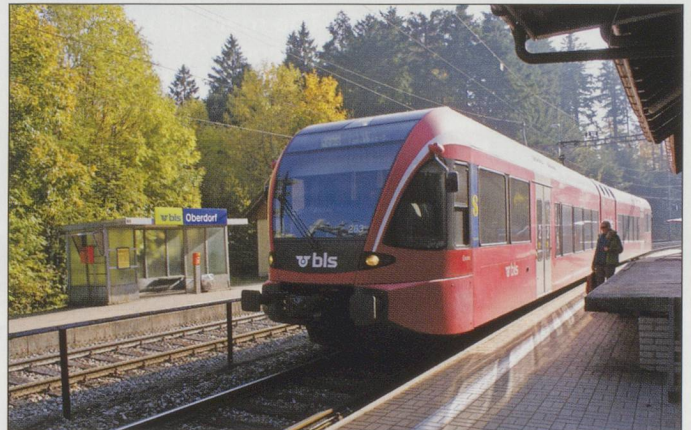
Oberdorf on the line from Solothurn to Moutier, threatened with closure.