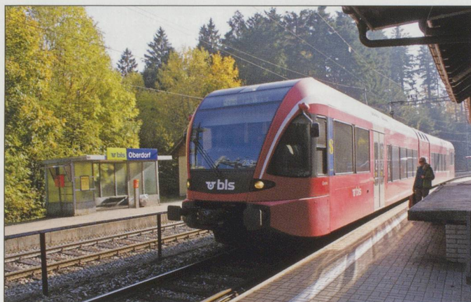
Oberdorf on the line from Solothurn to Moutier, threatened with closure.