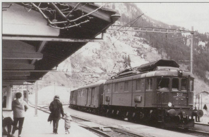
ABOVE: Ae6/8 No.207 on a local train from Spiez to Brig, at Blausee-Mitholz. This picture dates from 1967.