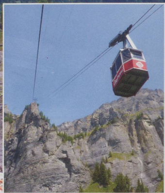
MAIN PICTURE: Looking back down on Leukerbad. LEFT: The cablecar up from Leukerbad.